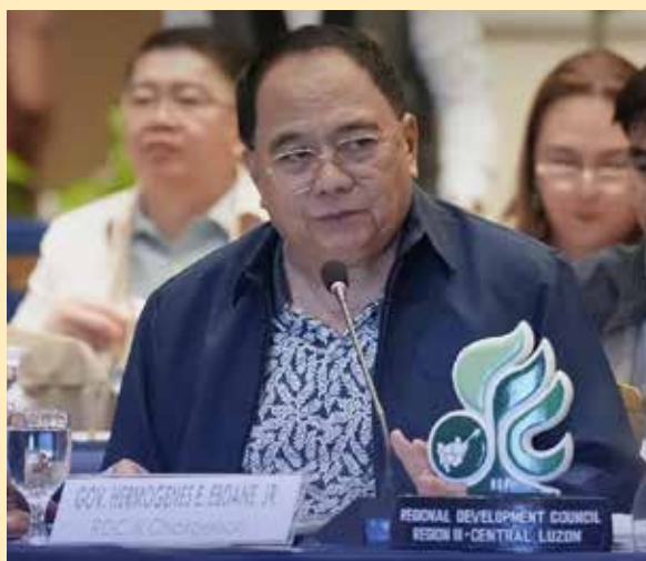
RDC chairman Zambales Gov. Hermogenes Ebdane Jr., approves the midterm update of the CLIP.

receive as part of its fleet expansion programme. Tan conveyed the company's gratitude to Airbus, its partner of over 40 years, and underscored the significance of welcoming the world's most modern widebody aircraft that has set new standards for intercontinental travel. "The arrival of the A350-1000 marks a significant milestone in our ongoing commitment to fleet modernization and network growth. It will be a source of Filipino pride and a transformational step for our airline," said Tan. Expected to fly PAL's transpacific routes, the aircraft features a spacious tri-class cabin layout, which can accommodate up to 382 passengers, with 42 seats in Business Class, 24 in Premium Economy, and 316 in Economy. The acquisition brings PAL's total fleet to 82 aircraft. Powered by Rolls-Royce Trent XWB-97 turbofan engines, each capable of delivering up to 97,000 pounds of thrust, the A350-1000 offers enhanced efficiency and reliability. The aircraft also sets new standards in sustainable aviation, featuring up to a 25% reduction in fuel consumption and carbon dioxide emissions compared with previous-generation aircraft, and is capable of being operated with sustainable aviation fuel. PAL Corporate Affairs Department