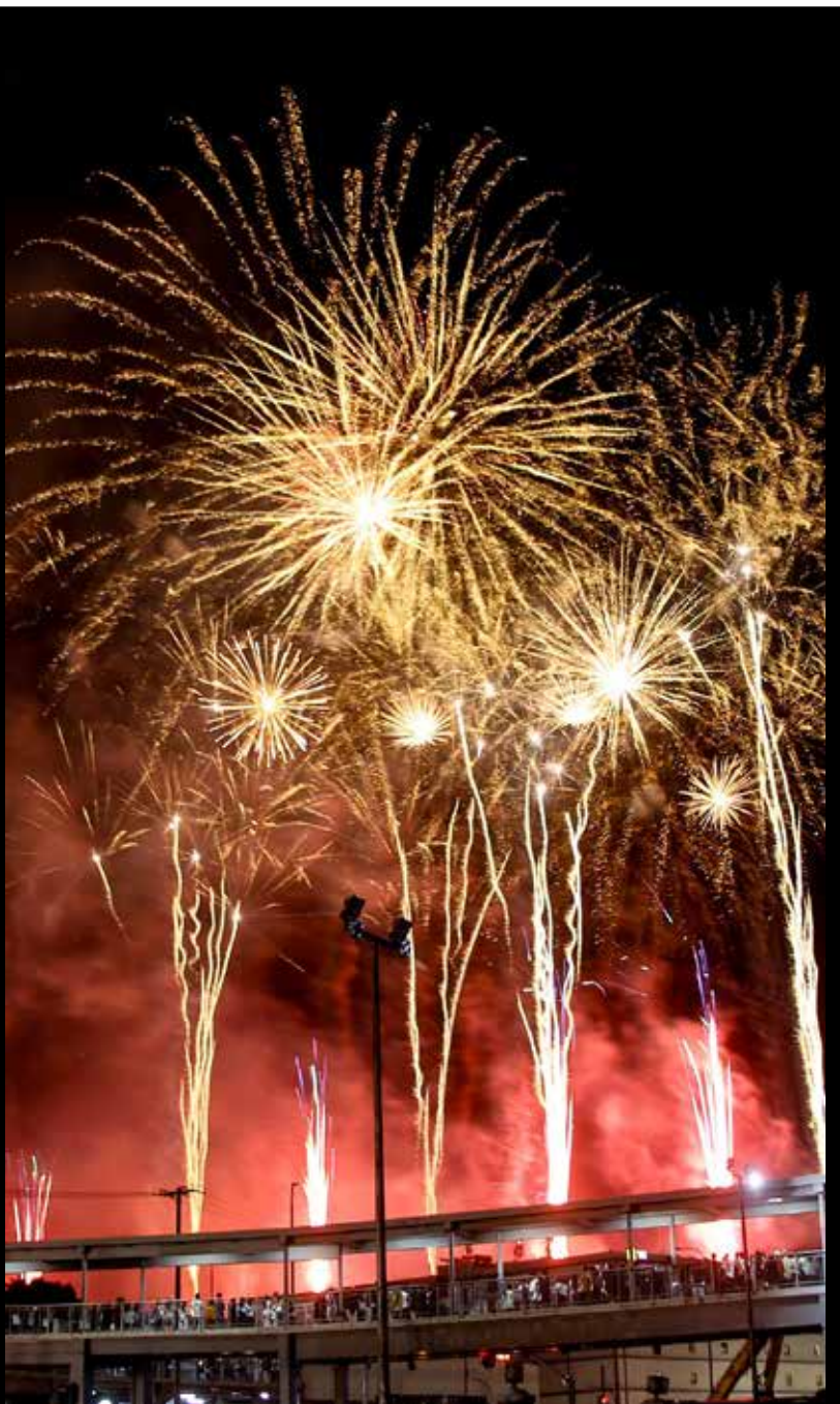
SKYSHOW. Clark’s night sky explodes in spectacular light and kaleidoscope of colors at SM CITY Clark’s Sky Line Fireworks Festival 2025 on Dec. 27, a fitting finish to 2025 and warm welcome to 2026.