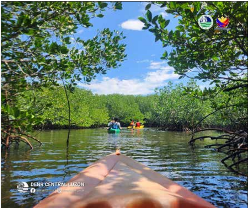
The Masinloc and Oyon Bay Protected Landscape and Seascape in Zambales.