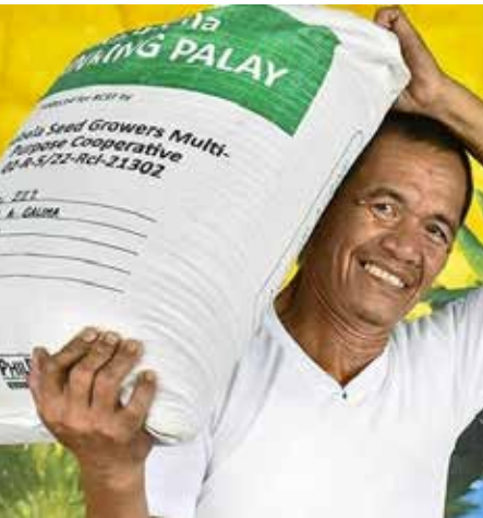
NE farmer takes home sack of certified inbred seeds.