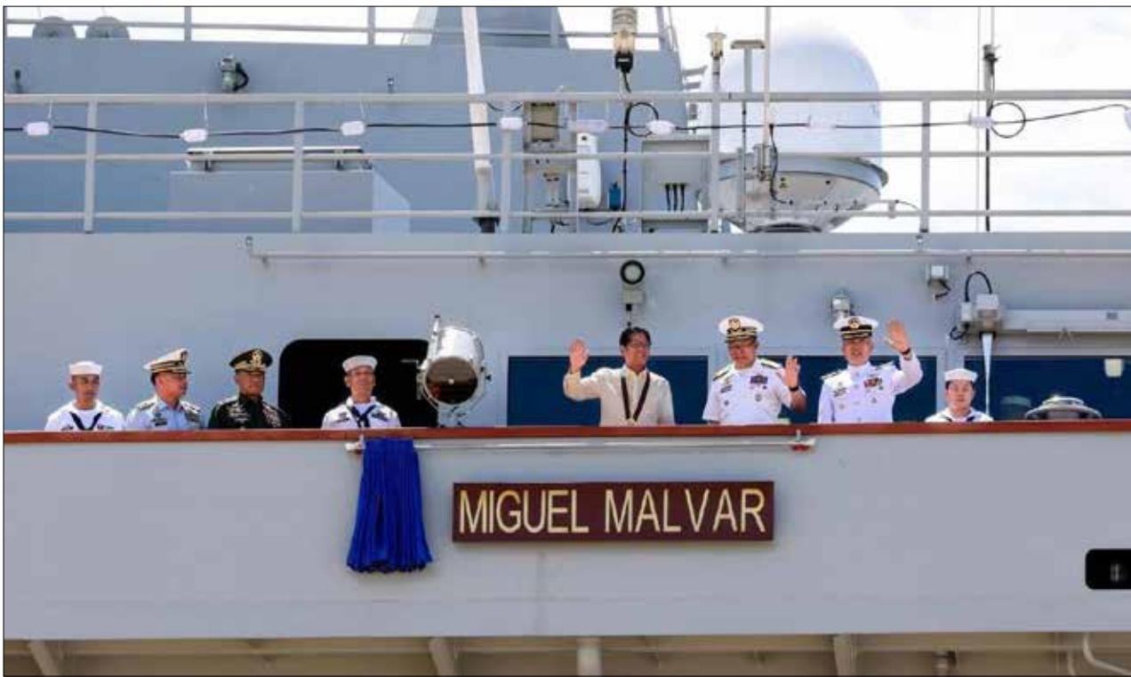
President Ferdinand R. Marcos Jr. leads the commissioning ceremony of BRP Miguel Malvar (FFG06), a guided-missile frigate named after the last Filipino general to surrender during the Philippine-American War.