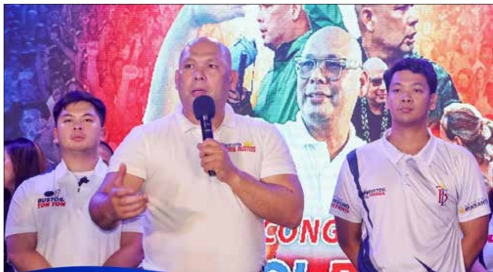
Triple loss: Family Bustos