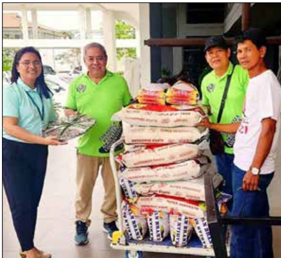
Farmers in Zaragoza, Nueva Ecija who availed themselves of RiceBIS 2.0 deliver their products as the main ingredient to the popular San Vicente’s Homemade Kakanin in San Jose City, Nueva Ecija.