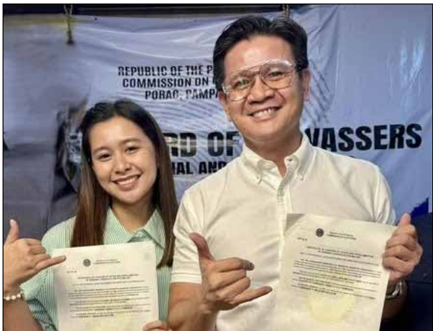
Winning Capil father-daughter: Mayor Jing-VM Jen