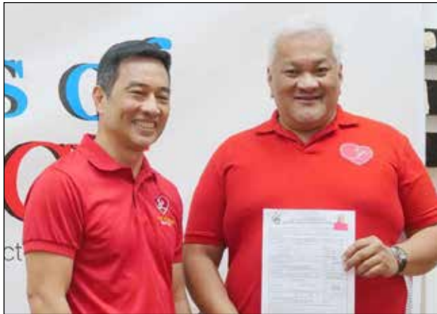
Switching siblings: Mayor-elect Cong Jon, Congressman-elect Mayor Pogi