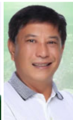
Hon. NOEL N. RIVERA Rep.-3rd District