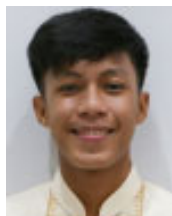
Hon. BM Lukecorinth Q. Pagarigan