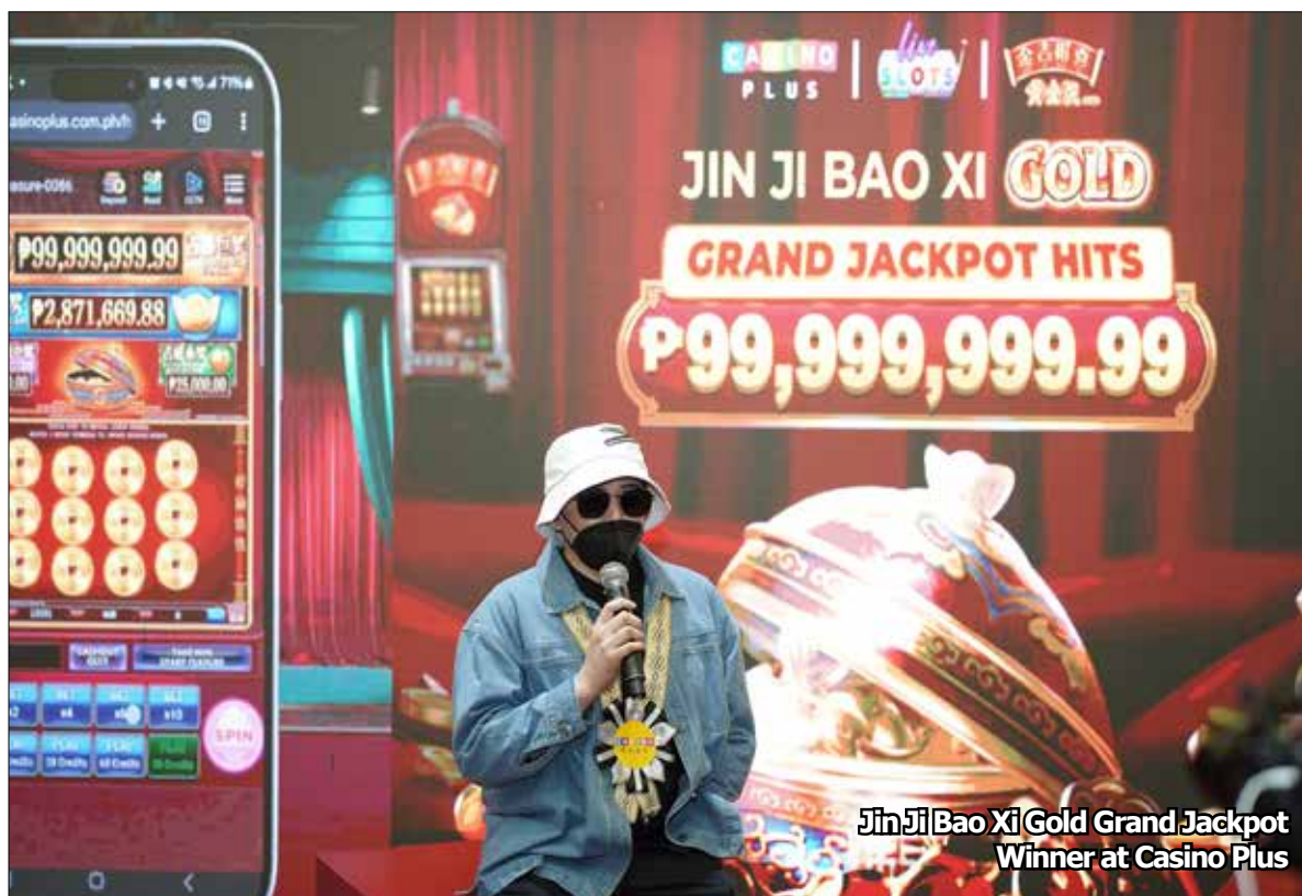
Jin Ji Bao Xi Gold Grand Jackpot Winner at Casino Plus