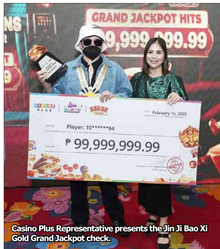
Casino Plus Representative presents the Jin Ji Bao Xi Gold Grand Jackpot check.

THE WAIT IS OVER! A lucky player has just made history by hitting the ₱99,999,999.99 Grand Jackpot on Jin Ji Bao Xi Gold with a P88 spin, marking the maximum jackpot possible for this game across all casinos and gaming platforms in the Philippines. This ₱99M jackpot is enough for a single person to buy a brand-new car every five years for the next 495 years.