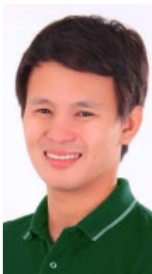
Hon. CHRISTIAN TELL A. YAP Rep.-2nd District