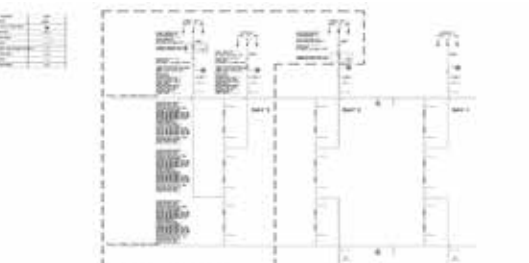
Figure 4. Single Line Diagram for the Hanjin Substation 32

The Power Project is included in the DOE List of Indicative Private Sector Initiated Power Projects in Luzon