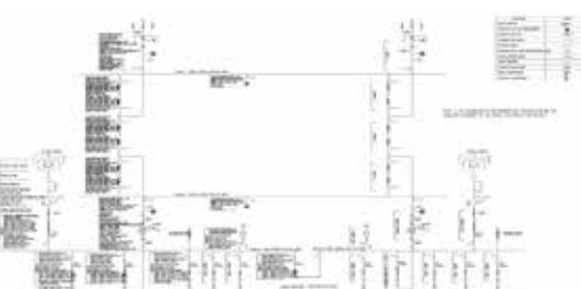
Figure 3. Single Line Diagram for the Substation 31