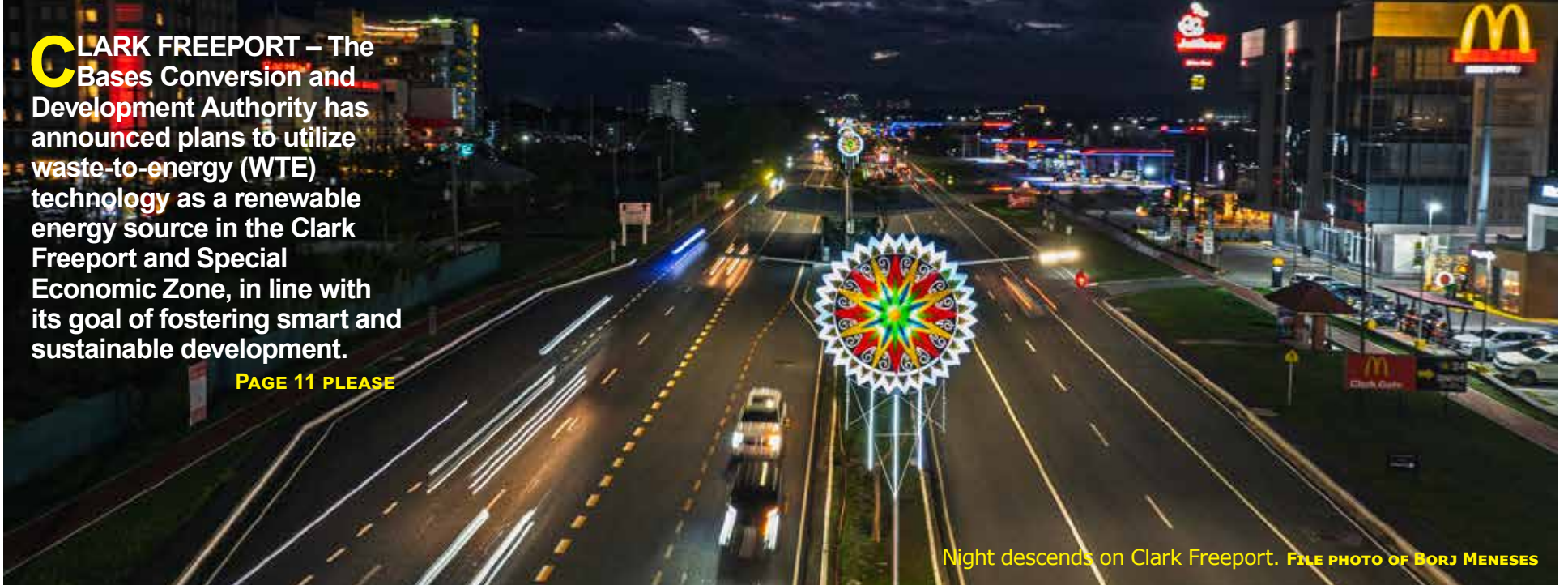
Night descends on Clark Freeport.