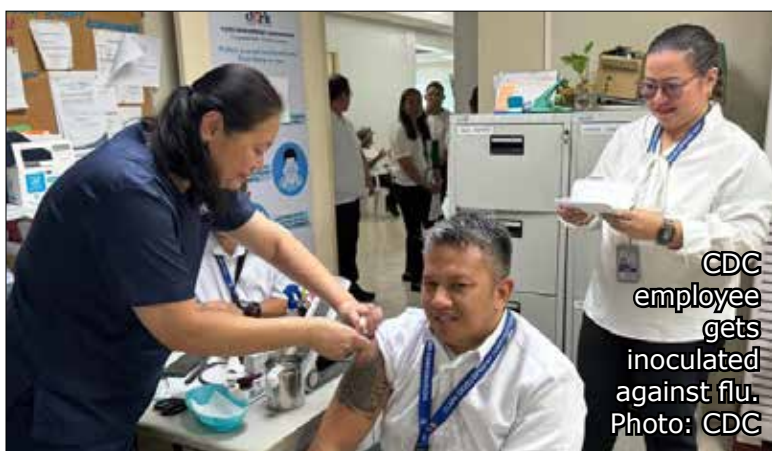
CDC employee gets inoculated against flu.