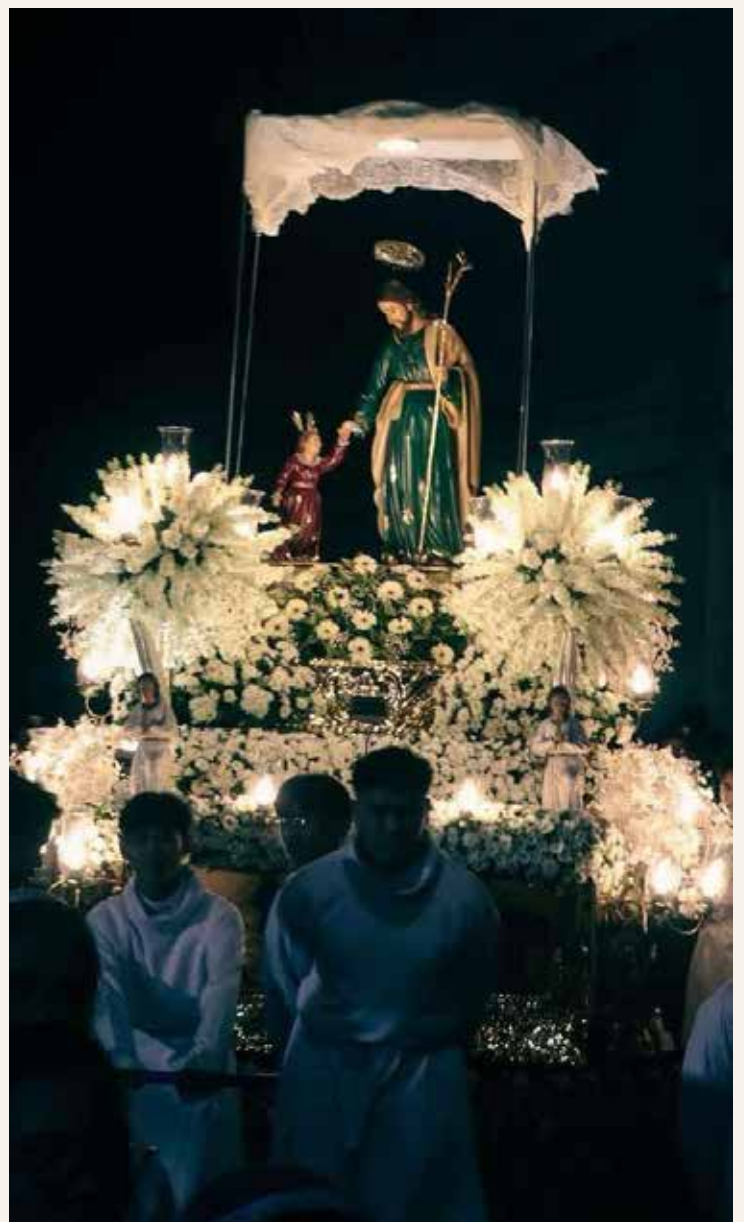
The Santo Niño Festival is not merely a commemoration of a miraculous event—it's a living testament to the power of prayer, the strength of community, and the enduring legacy of devotion that binds the people of this town together.

As the first anniversary of the Santo Niño's return comes to a close, Floridablanca stands united in faith and pride.