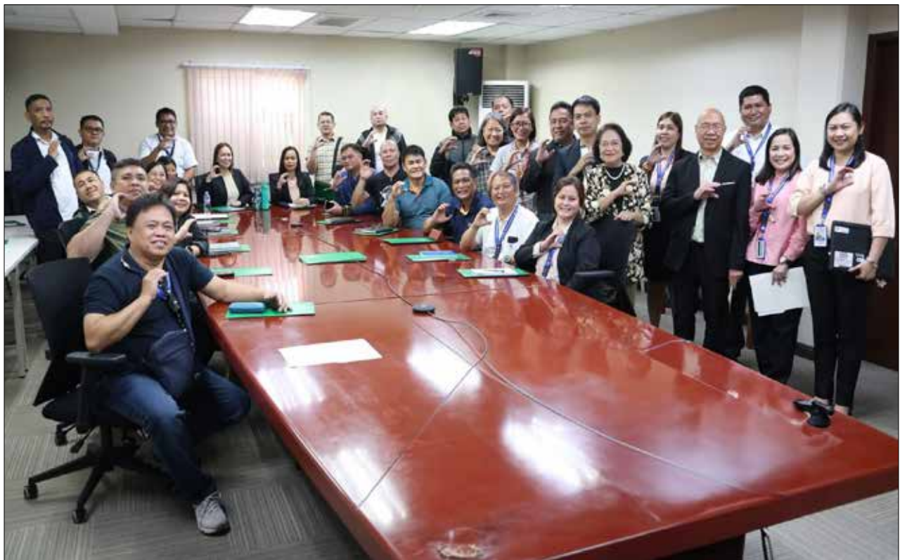
CDC and CCA officials with worker-scholars. CONTRIBUTED PHOTO

Punto! Central Luzon: January 13, 20 & 27, 2025