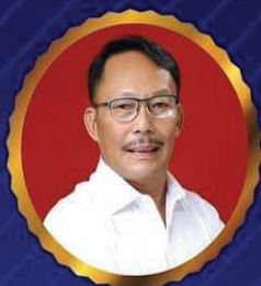
Edgardo Yambao Posthumous Category for Government Service