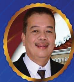
Enrique Baking Education