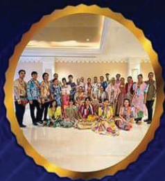
ArtiStaRita Institutional Category For Performing Arts