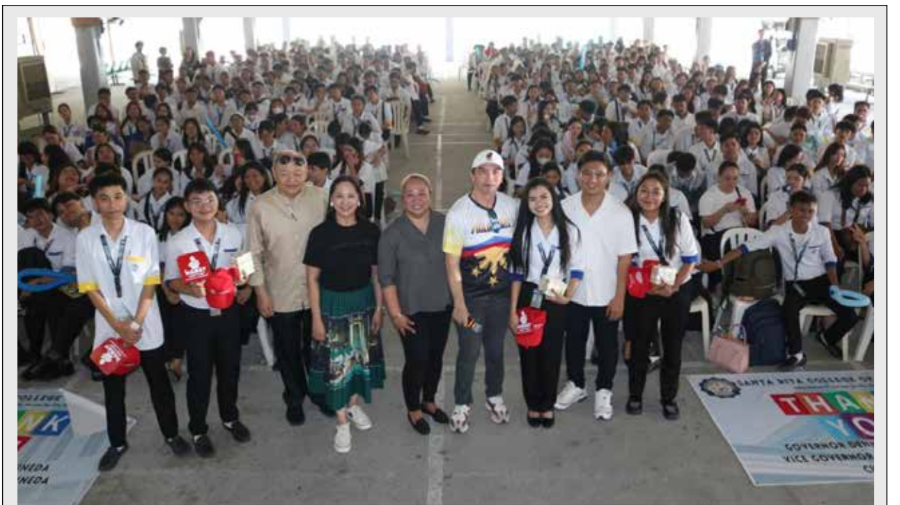
Happy students with provincial officials during the Tulong-Dunong assistance distributions.