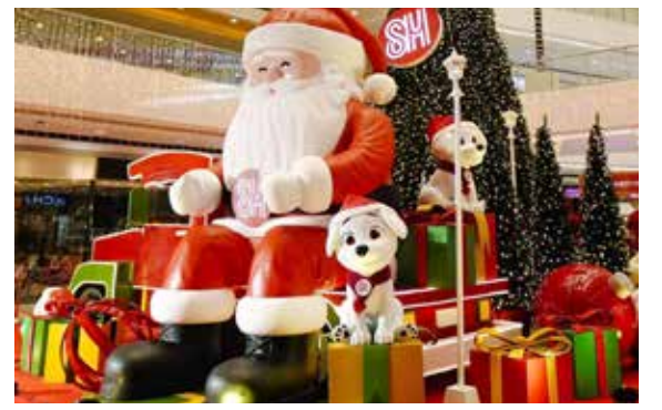
SM Center Pulilan unfolds a Royal Christmas Adventure that resonates with the grandiose celebration of the holiday festivities. Designed with pure elegance, the attraction is built with golden staircases and a regal platform where a magnificent 27-foot Christmas tree stands tall. Shoppers will be greeted by 5-foot Santa figures, alongside his classic sleigh and majestic reindeers.