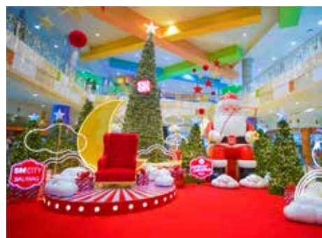
SM City Baliwag unveils Santa's Magical Dreamland. The centerpiece exudes whimsical wonders, highlighted by a classic 30-foot Christmas tree. A giant Santa catching stars while sitting on celestial clouds is an eye-catcher, while the radiant moon and gift boxes surrounding the attraction will melt everyone's heart this holiday season.

These events ignite the spirit of Christmas, bringing joy to all who visit. Visitors experience the magic of the holidays at SM Supermalls in North Luzon, where a season of warmth, celebration, and festive fun awaits.