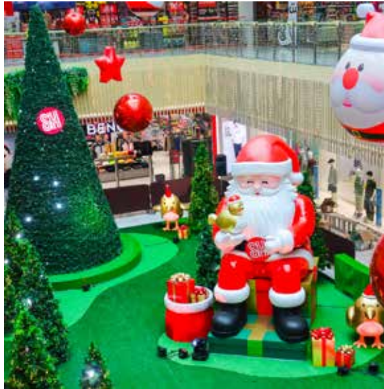
Explore Santa's Bird Land Adventure, a Christmas display inspired by Balanga City's iconic migratory birds at SM City Bataan. Marvel at the gigantic 18-foot Santa, 25-foot Christmas tree beautifully adorned with warm white lights, surrounded by vibrant birds and lush trees.