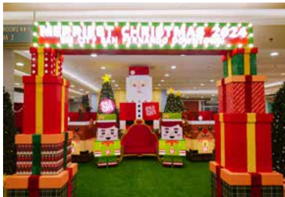
Discover the magic of the CHRISTMAS ON STACKS Centerpiece at SM City San Fernando Downtown! Marvel at the 12-foot Santa Claus, the cheerful elves, and reindeer amidst the colorful display of Christmas boxes.

This year, SM Cares introduces the Hug-A-Mood collection—adorable plush toys that reflect a range of emotions children experience, making them the perfect gift for the season. For every bear purchased, a second bear will be donated to a child in need, sharing the warmth of Christmas.