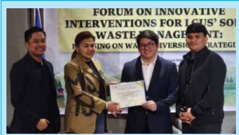
EPMC recognized at the Forum on Innovative Interventions for LGUs.