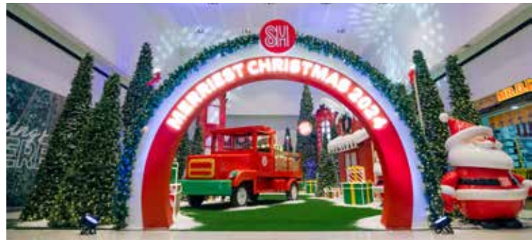
SM Megacentre Cabanatuan's holiday centerpiece Santa's Coming to town is a story about bringing joy and spreading warmth for everyone. Standing proudly amidst the scene is a magnificent 25-foot Christmas tree, complemented by a 13-foot Santa Claus gracefully riding a vintage pickup truck laden with presents.

But the holiday fun doesn't stop there. Shoppers and mall-goers enjoy a variety of festive activities at select SM malls, including photo opportunities with spectacular Christmas installations, Christmas parades, Santa meet-and-greets, live musical performances, and dazzling fireworks displays.