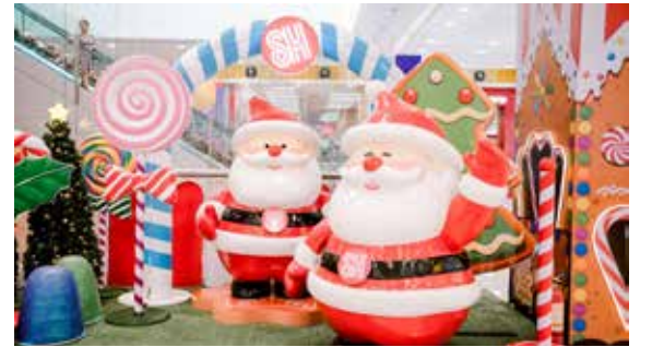
The fun continues at SM City Olongapo Downtown as they unveiled their highly anticipated Christmas centerpiece, themed "Gingerbread Fun." It featured 5 adorable dancing Santas, amid the backdrop of lush Christmas trees and charming gingerbread houses. Surrounded with giant candy cane paired with mistletoe, Christmas sweets in fun and exciting colors and candy arch.