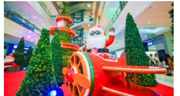
Get ready to experience the CHRISTMAS FLIGHT around the world! Experience a magical odyssey at SM City Cabanatuan's Christmas Centerpiece, where a tapestry of diverse traditions awaits. The focal point is a towering 35-foot Christmas tree adorned with glistening lights, complemented by a 15-foot Santa Claus riding a plane, poised to embark on an exhilarating journey!