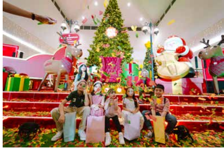
Celebrating joyful moments at SM City Pampanga with Santa's Musical Quartet! The kids are brimming with holiday cheer, surrounded by colorful confetti and festive decorations

The magic of Christmas has arrived early at SM Supermalls across North Luzon. The malls lit up with aweSM Christmas centerpieces, officially ushering in the holiday season.