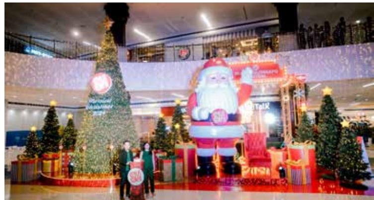
Be dazzled by Santa's Wonder City, a Christmas setup inspired by the glitz and glamour of Las Vegas at SM City Olongapo Central. Adorned with a 27-foot-tall Christmas tree, decorated with warm white Christmas lights beside a neon marquee, setting the stage for a Vegas-inspired holiday spectacle. Surrounding the grand tree are whimsical, oversized Christmas gift boxes, all wrapped in shiny metallic papers with giant bows. In the middle stands a giant 15-foot Santa Claus adds a touch of festive cheer, making this the perfect backdrop for holiday photos.