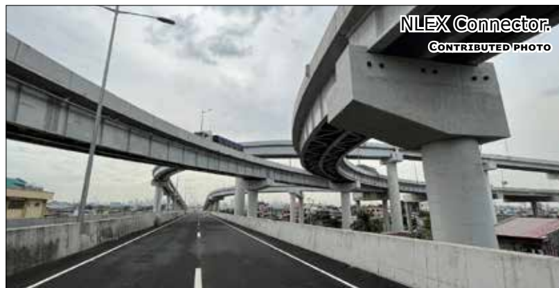
NLEX Connector.