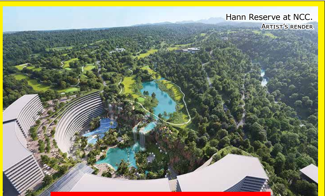
Hann Reserve at NCC. ARTIST'S RENDER