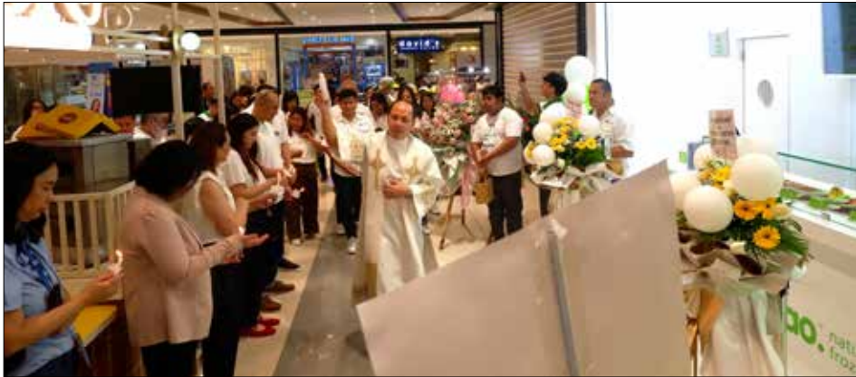
BLESSING. Executives and officials of Aquino Bistro Group and SM City Tarlac gathered on Sept. 26 for the blessing of Ilaollao at the mall's food court.