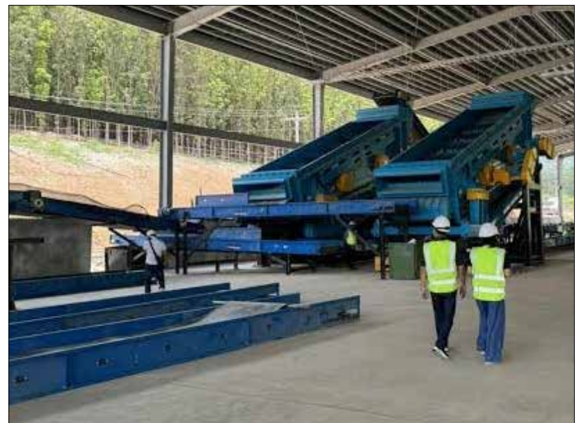
Prime Waste Solutions facility in Porac, Pampanga.