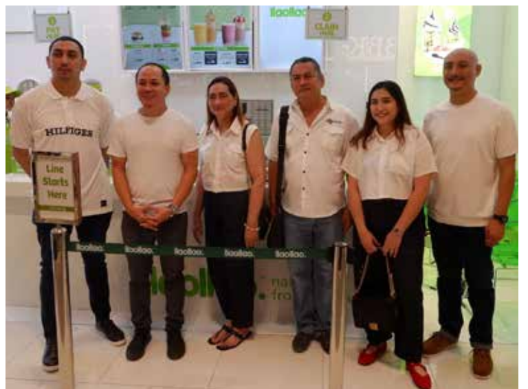
BEHIND IIAOIIAO TARLAC. The Aquino clan brings the goodness of Ilaollao to Tarlac, complementing outlets in Pampanga.