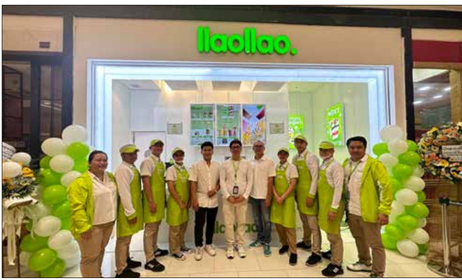
IIAOIIAO CREW. The Ilaollao SM City Tarlac crew are all smiles on opening day.