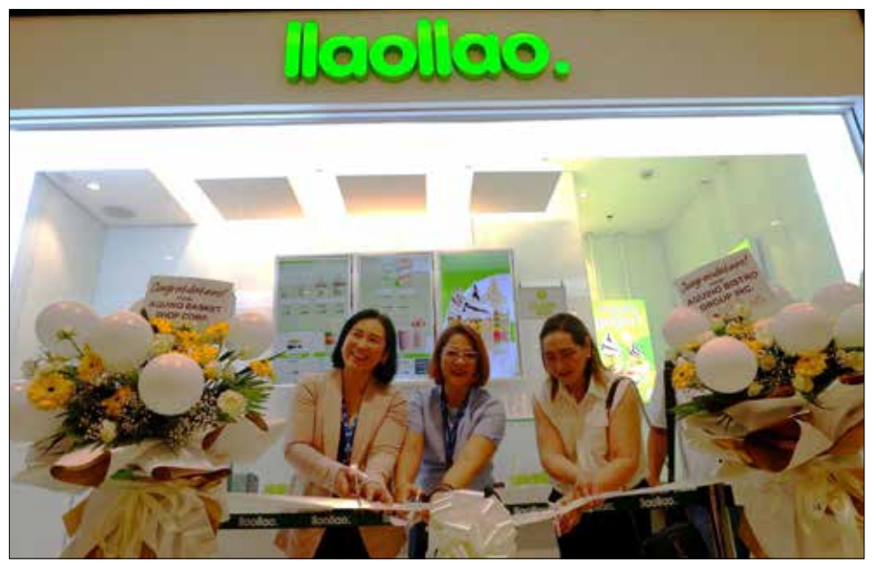
RIBBON CUTTING. The swirling starts as the ribbon is cut for the opening of Ilaollao SM City Tarlac.