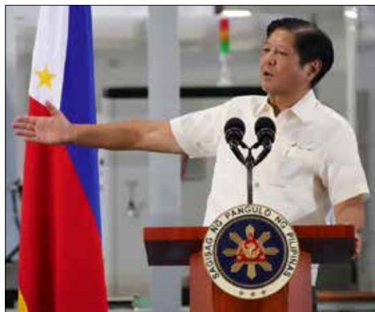
President Marcos Jr. cites StB Giga Factory for laying groundwork for a cleaner, greener, and a more prosperous Bagong Pilipinas.