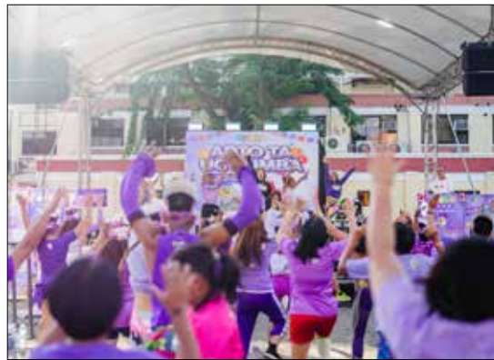
A shot of event-goers enjoying the high-energy Zumba exercises at Rizal Park.