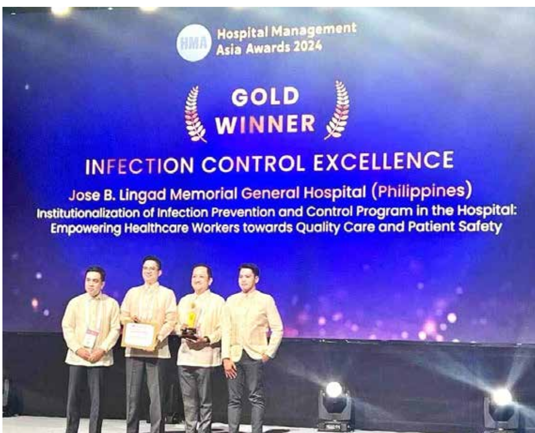
JBL HOSPITAL: GOLD WINNER IN ASIA AWARDS CITY OF SAN FERNANDO – The Jose B. Lingad Memorial General Hospital has been hailed as Gold Winner at the Hospital Management Asia Awards 2024 held recently in Bali, Indonesia for the institutionalization of its infection prevention and control program empowering health care workers towards quality care and patient safety.

Pati abogado may hawak ng kaso dapat ay isama na rin sa asunto bakit di himukin ang kliyente nito harapin ang kaso doon sa husgado baliin ang mali ituwid ang wasto sa ngalan ng batas ng ating gobyerno