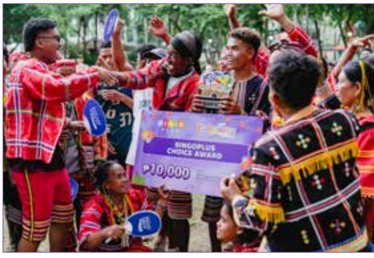
The Sining Sayon Dawet Cultural Ensemble from Davao City National High School in the Open category celebrating their win.