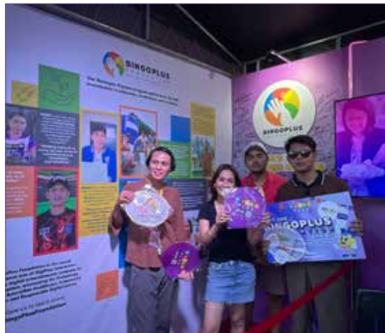
BingoPlus Foundation's Freedom Wall at the Magsaysay Park BingoPlus Booth.