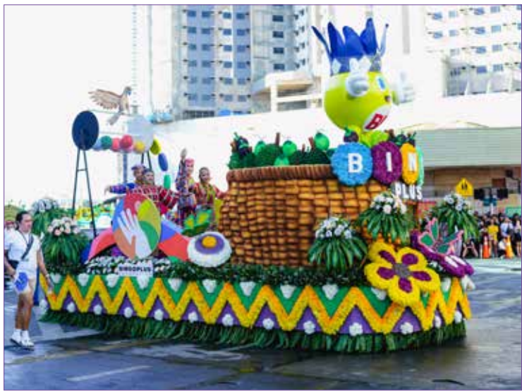
The BingoPlus Kadayawan-themed float as it drove along the parade route on August 18, featuring the BingoPlus Foundation logo at the side.

BINGOPLUS, your comprehensive entertainment platform in the country, has once again amped up the fun and entertainment for Filipinos with a special appearance at the Kadayawan Festival 2024.