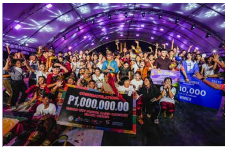
The Balangay City High Performing Arts from City Of Mati National High School in the School Based category celebrating their win.