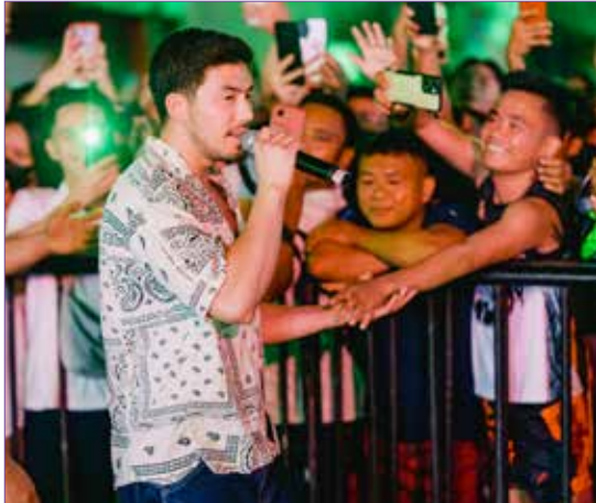
Tony Labrusca interacting with fans at one of the BingoPlus stages.