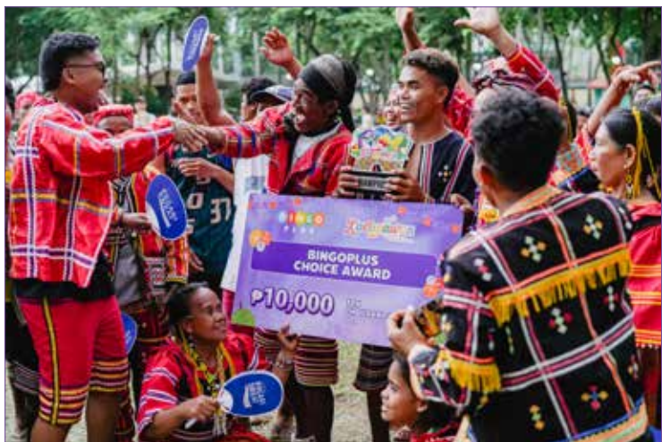
One of the overall champions of the Dula sa Kadayawan event, holding their BingoPlus Choice Award.