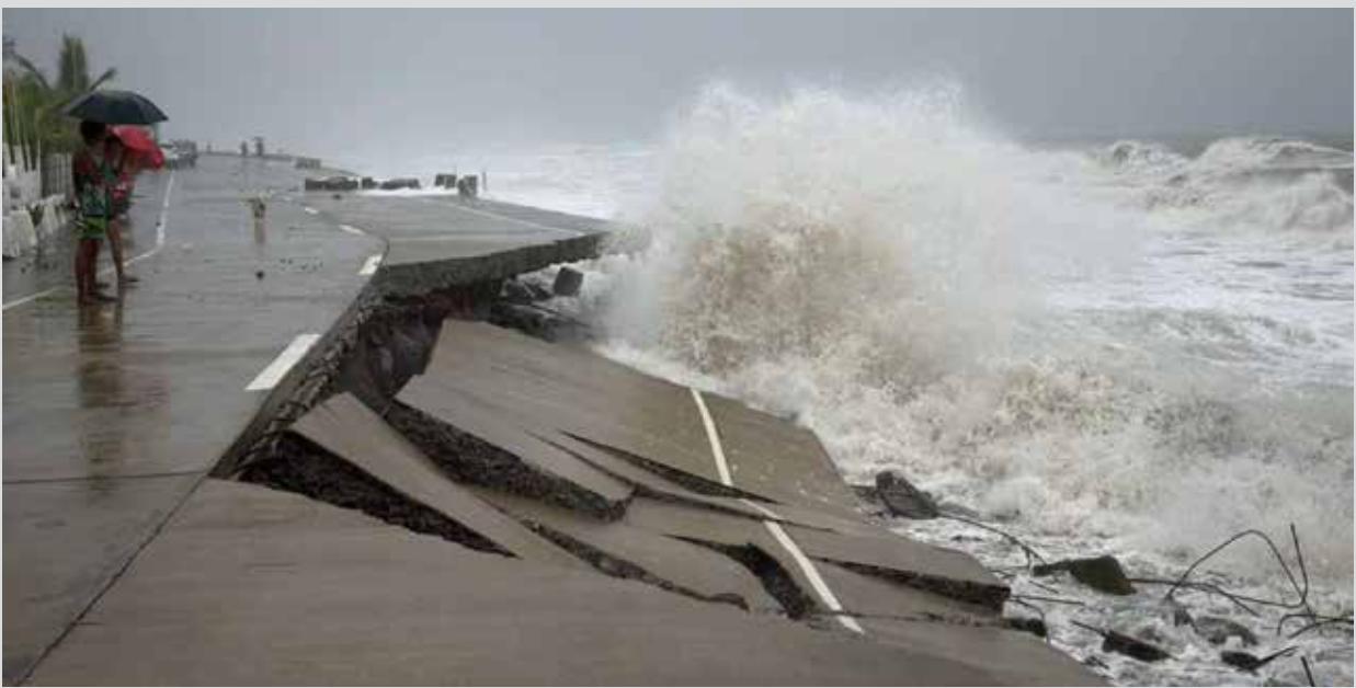
Storm surge destroys a portion of the coastal road at Sitio Tektek, an area identified as a dynamic zone where coastal accretion and erosion occur in cycles.