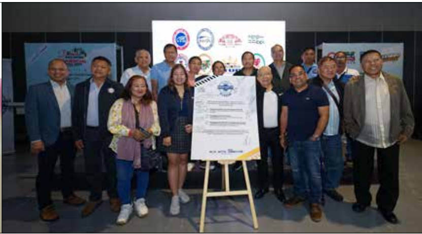
Leaders of transport organizations pose with signed Mission Road Safety pledge.