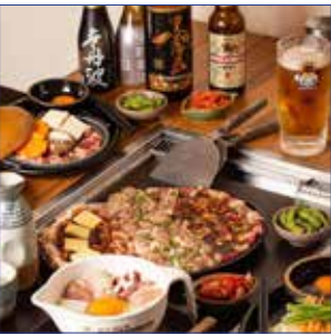
Gather the family around, and savor the finest moments with dad while indulging in Dohtonbori’s Deluxe Okonomiyaki and Yakiniku 3-Meat Party Set and drinks. Dine in at their branches in SM City Pampanga and SM City Clark.