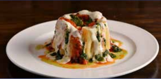
Grab a taste of Vesuvio and dive into a mountain of rigatoni dressed in a delightful trio of pesto, alfredo and pomodoro sauces, available at Mama Lou’s in SM City Bataan and SM City Clark.