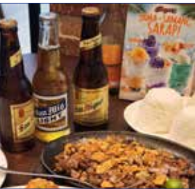
Have dad a taste of his chilled Beer and Sizzling Sisig from Gerry’s – the perfect pair to unwind. Visit them at SM City Olongapo Central, SM City Bataan, SM City Tarlac, SM City Marilao, SM City Baliwag, SM Center Pulilan, SM City Cabanatuan, SM City Clark, and SM City Pampanga.

This Father’s Day, let SM Malls in Central Luzon take you and dad on a culinary adventure he won’t forget. After all, there’s no better way to show your appreciation than with good food, good company, and good times. Cheers to all dads! To know more about SM Supermalls’ events, promo and deals this Father’s Day, visit www.smsupermalls.com or follow @SMSupermalls on social media.