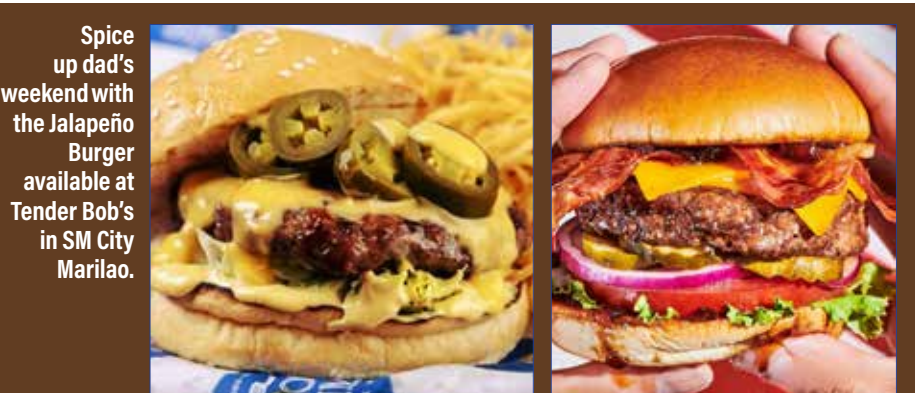
Spice up dad’s weekend with the Jalapeño Burger available at Tender Bob’s in SM City Marilao.