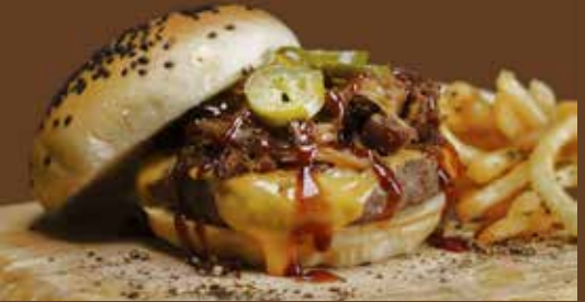
Treat dad to a mouthwatering dish, El Luchador Burger, at Champas located at the ground level of SM City Baliwag and SM City Clark.