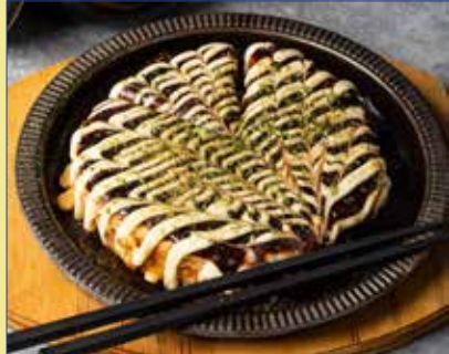
Enjoy an exciting Okonomiyaki experience at Dohtonbori in SM City Pampanga.