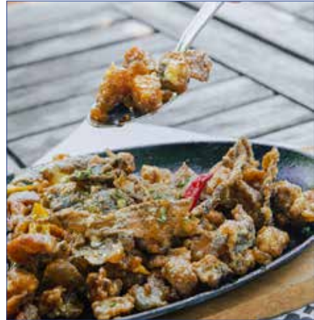
Savor a bite at Max’s Crispy Bangus Sisig, a deliciously marinated boneless milkfish belly with onions, ginger, and crispy bangus skin. Visit Max’s at SM City Olongapo Central, SM City Cabanatuan, SM City Clark, SM City Pampanga, and SM City Marilao.

There is something about the freshness and taste of seafood that just hits differently. The freshness and flavors of the seas brought right to your table make for an unforgettable dining experience. Treat dad to a seafood feast at Mesa and Max’s. Try Botejyu’s succulent shrimp, tender calamari, and juicy crab legs, all seasoned to perfection, and serve with a side of garlic butter and zesty lemon sauce.