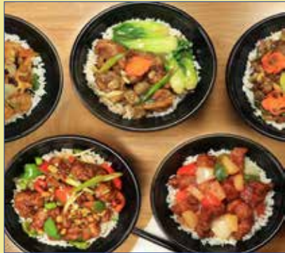
Indulge in a symphony of flavors with their delicious Shanghai Wok Bowls from Modern Shang at SM City Clark.

Everyone loves a good burger! Champas, Tender Bob’s and TGIFriday’s take this classic comfort food to a whole new level. Think of juicy beef patties stacked high with delicious fixings, smothered in melted cheese, and all nestled in a soft brioche bun, and you’ve got a surefire way to put a big grin on dad’s face.