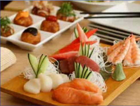
Dive into flavor of crowd seafood favorites. From tasty tempura to classic sushi rolls, Botejyu brings the taste of the ocean straight to your table. Experience the ocean’s bounty at Botejyu, located at SM City Olongapo Central, SM City Cabanatuan, SM City Tarlac, SM City Pampanga, SM City Clark, SM City Marilao, and SM City Baliwag.

Have a taste of Mesa’s Baked Scallops! Enjoy its meat flavor with fresh garlic-butter and oyster sauce. Visit them at SM City Olongapo Central, SM City Telabastagan, SM City Pampanga, and SM City Clark.