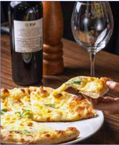
Embrace the classic goodness of Garlic and Cheese Pizza at Italianni’s. Simple, satisfying, and always a favorite at SM City Clark.