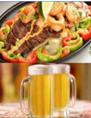
Let dad sip on his ice-cold beer served in frosted mug or pitcher, while enjoying the sizzling steak and shrimp Fajita at Chili’s in SM City Clark and SM City Pampanga.

Cap off the celebration with ice cold beers from Chili’s, Dohtonbori, and Gerry’s Grill! Complement these refreshing beers with mouthwatering bar snacks or a hearty meal for a fusion of flavors. Raise a glass to dad and enjoy the perfect pairing that will make Father’s Day celebration extra special.