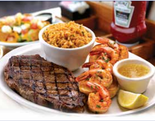
Feast on Ultimate Surf & Turf Delight at Texas Roadhouse: a very juicy ribeye and flavorful shrimp duo that is a match made in culinary heaven! Available at SM City Clark.

They say the way to a man’s heart is through his stomach, and dads are no exception to that rule. SM Supermalls has got you covered with a wide range of dining options guaranteed to make every dad feel loved and satisfied on Father’s Day. Whether he is a steak aficionado, a lover of hearty comfort foods, or an adventurous diner eager to explore new flavors, SM has it all. Here are six dad-approved picks to make your Father’s Day celebration extra special.