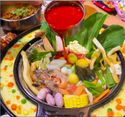
Treat dad to a sumptuous K-feast at Dookki in SM City Marilao, SM City Pampanga, and SM City Clark.