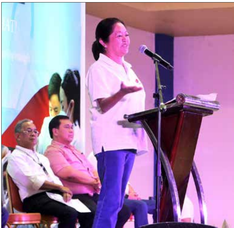
First Lady Marie Louise "Liza" Araneta-Marcos brings "Lab for All" to the Subic Freeport.