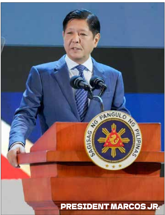
PRESIDENT MARCOS JR.