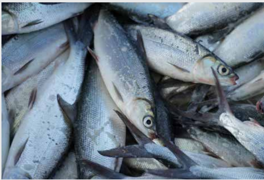
Rich catch of bangus.