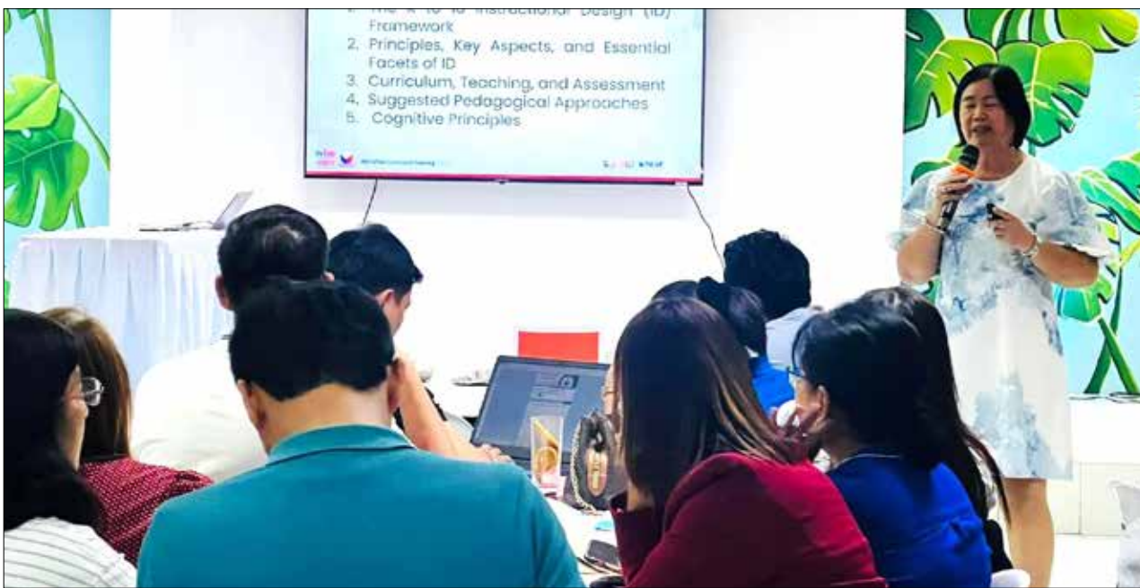
Discussions on the Matatag curriculum.