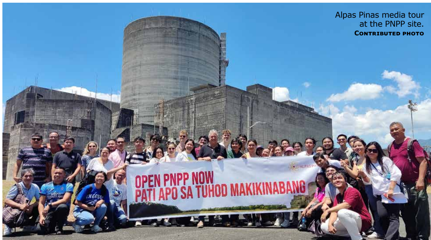
Alpas Pinas media tour at the PNPP site.

M ORONG, Bataan – In view of the country’s low power reserves, a non-stock, non-profit organization leading the advocacy for nuclear energy as a clean energy source has underscored the urgency of exploring the activation of the Philippine Nuclear Power Plant (PNPP). PAGE 9 PLEASE