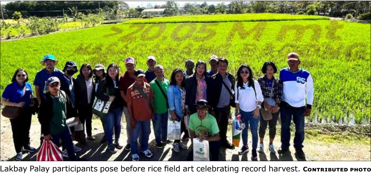
Lakbay Palay participants pose before rice field art celebrating record harvest.

SCIENCE CITY OF MUÑOZ -- The Philippine Rice Research Institute (PhilRice) cited its contribution to the country's record harvest of 20.06 million metric tons of rice in 2023. This, through its distribution of certified inbred seeds through the Rice Competitiveness Enhancement Fund (RCEF) Seed Program and trained farmers, farm workers, and extension workers