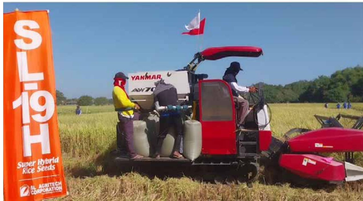
Farmers use mechanized harvester. PHOTO: ARMAND M. GALANG

Aside from this, it is also necessary for the cooperative or association to have sufficient funds set aside for the operational maintenance of the onion cold storage, particularly for expenses in electricity and diesel if it is necessary to use a generator set during power interruptions to ensure continued operations. DA is set to build two more facilities for onion growers in the city of Palayan and municipality of Gabaldon. Construction is set to begin by either the end of March or the first week of April. PIA-3/ Photos: DA-3