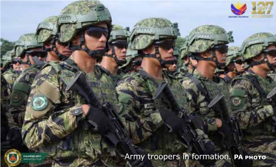
Army troopers in formation.

(CATEX) which tests the capability of the Army to move, maneuver, and sustain large-scale forces during combat operations. “We just concluded the conduct of CATEX— the first Army field exercise composed of more than 3,000 troops on the ground performing the territorial defense operation and capability domain we are developing aside from the internal security operation that we normally do,” he explained. CATEX is in compliance with the Department of National Defense’s Comprehensive Archipelagic Defense Concept that ensures enhanced military capabilities to defend the land, air, and maritime domain. Apart from training