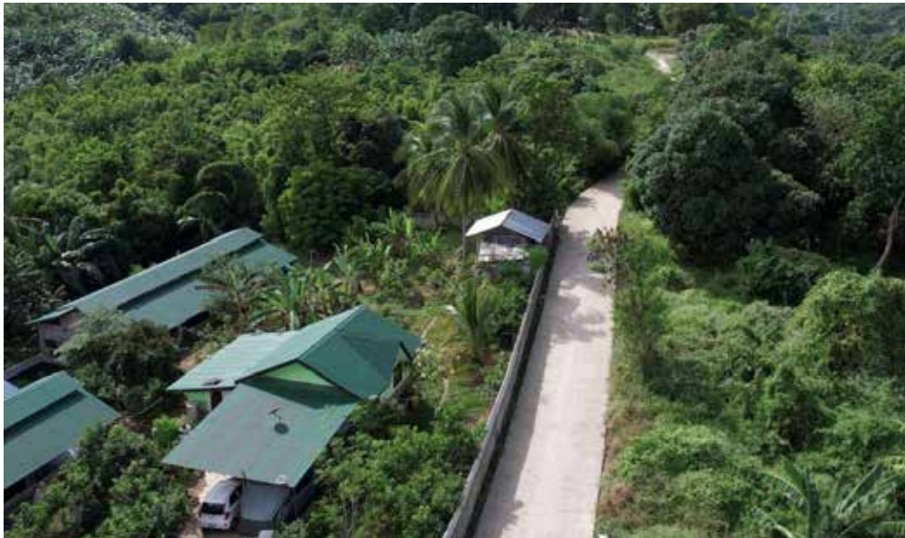
Concreted 1,003-meter farm-to-market road.