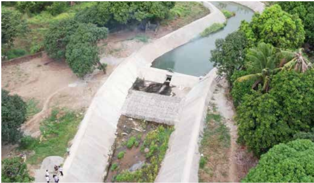
The completed diversion dam along Capitangan River.