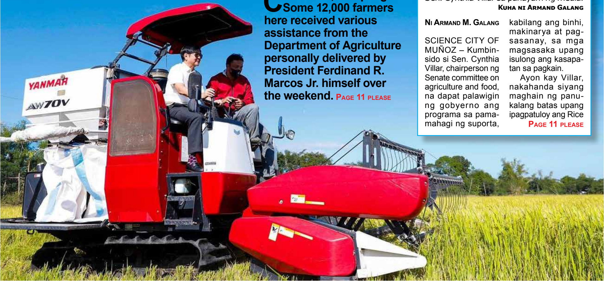
President Ferdinand R. Marcos Jr. tries hand at a rice combine harvester, one of the farm machinery the DA has been distributing to farmers to improve farm productivity.

C ANDABA, Pampanga – Some 12,000 farmers here received various assistance from the Department of Agriculture personally delivered by President Ferdinand R. Marcos Jr. himself over the weekend. PAGE 11 PLEASE