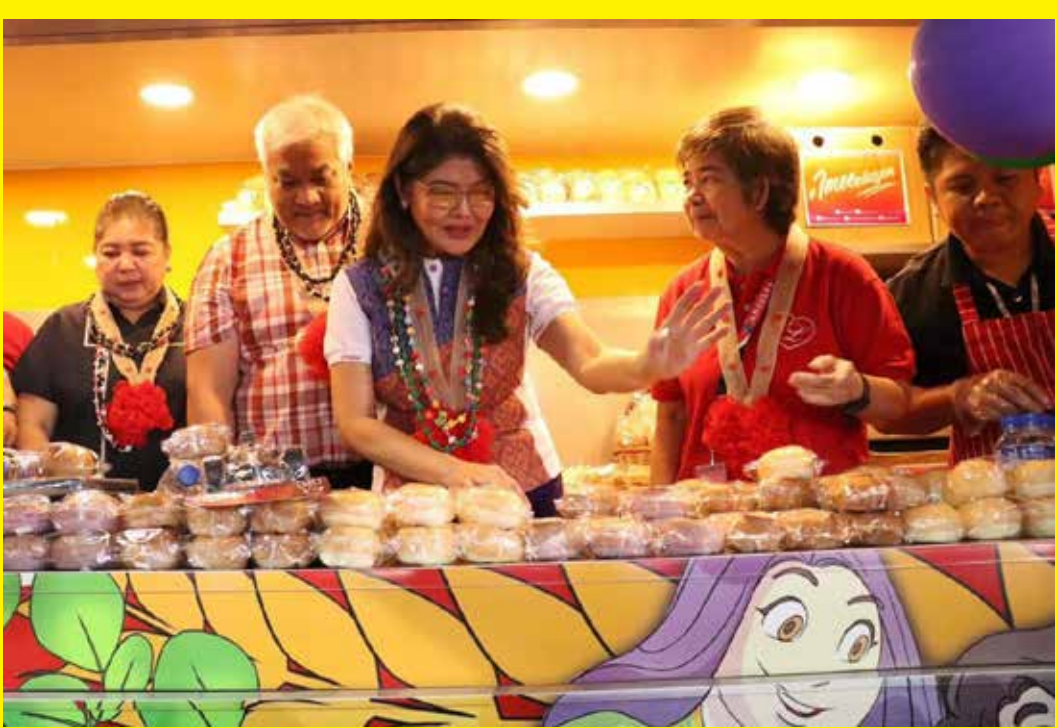
Sen. Imee Marcos distributing pusong mamon buns with Mayor Carmelo "Pogi" Lazatin Jr. and Vice Mayor Vicky-Vega Cabigting.