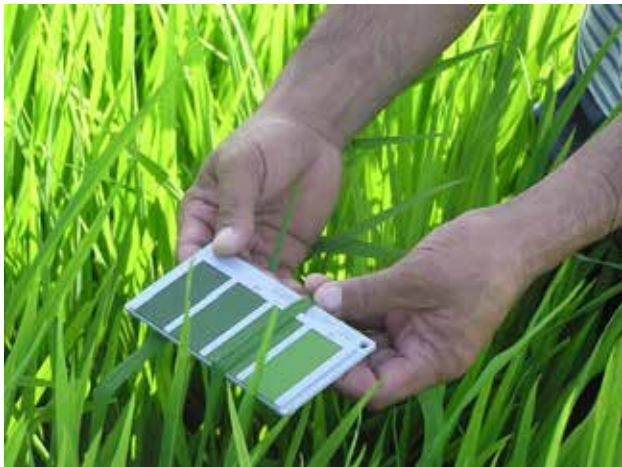
PhilRice technician checks status of rice plants using a four-color ruler for leaves color comparison or a mobile app that captures digital images of leaves.