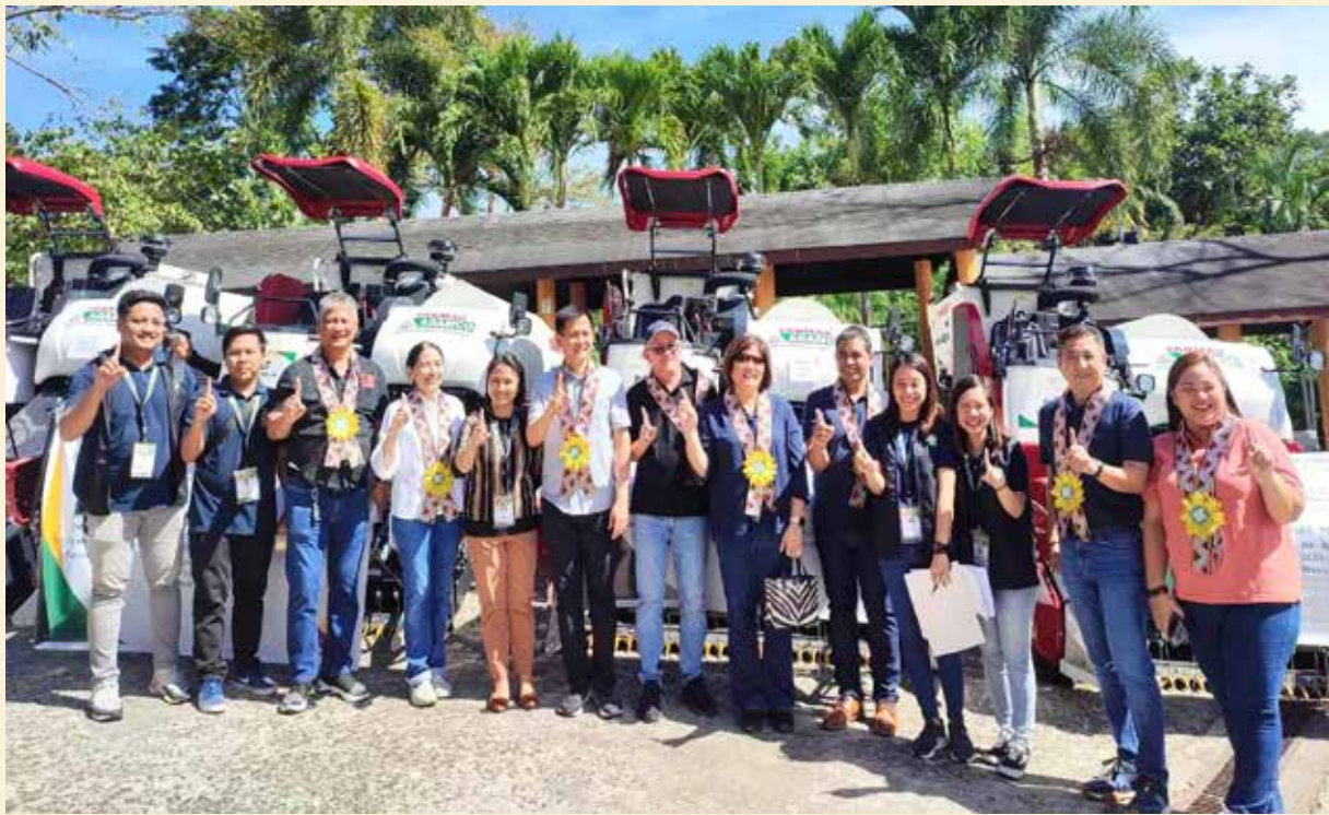
DA and Bataan officials during the distribution of the farm machinery.