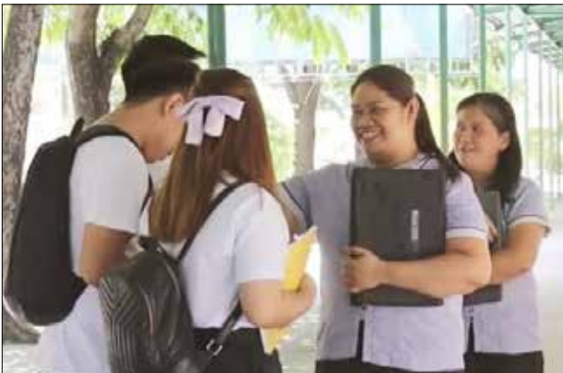
“Mano Po” gestures of respect observed at the San Fernando Elementary School.

For a copy of the Implementation Guidelines, download Regional Memoranda No. 004 s. 2024 from the DepEd Region III Website at region3.deped.gov.ph. DepEd-3-PR