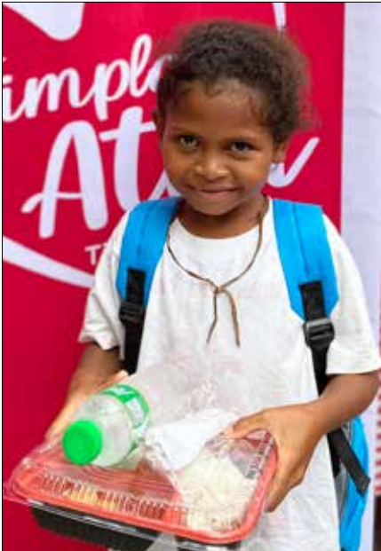
A student with her food pack from Meken.

Vantage Energy's annual Back-To-School Donation Drive was launched in 2020 during the pandemic with the support of customer partners like Meken. Since then, the program has already reached 19 schools and over 19,000 students nationwide.