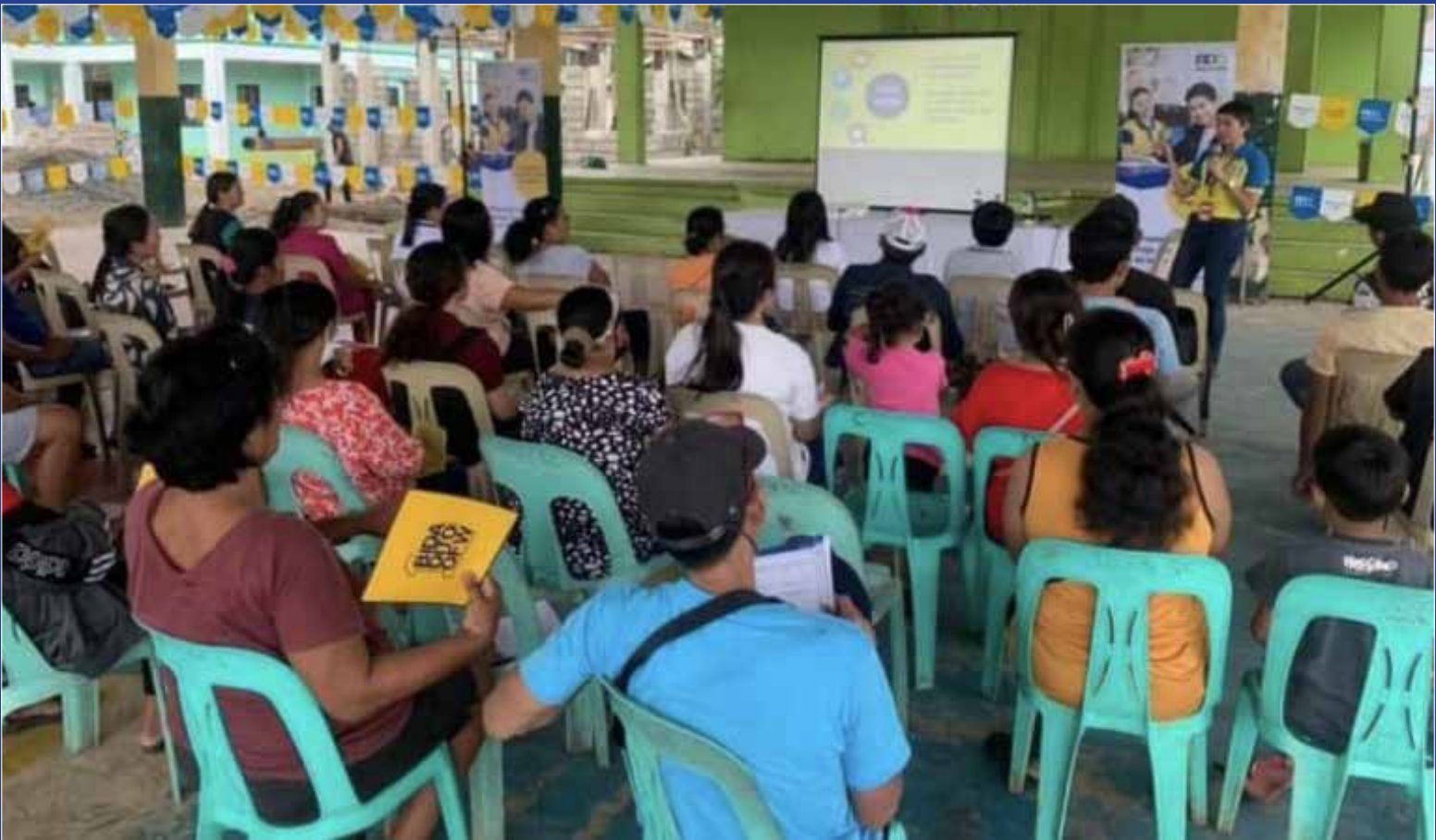
Financial education training ng BDO at BDO Network Bank sa Barangay Ipilan, Brooke's Point kung saan natutunan ng mga magsasaka at mangingisda ang tamang pamamahala ng pera at kita.