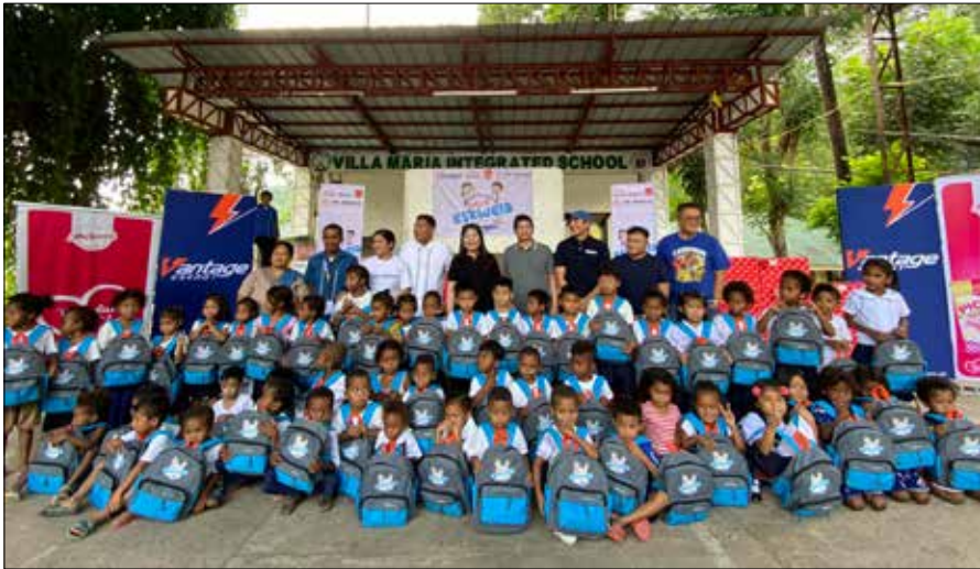
Villa Maria Integrated School teachers and students with representatives from Meken and Vantage Energy.