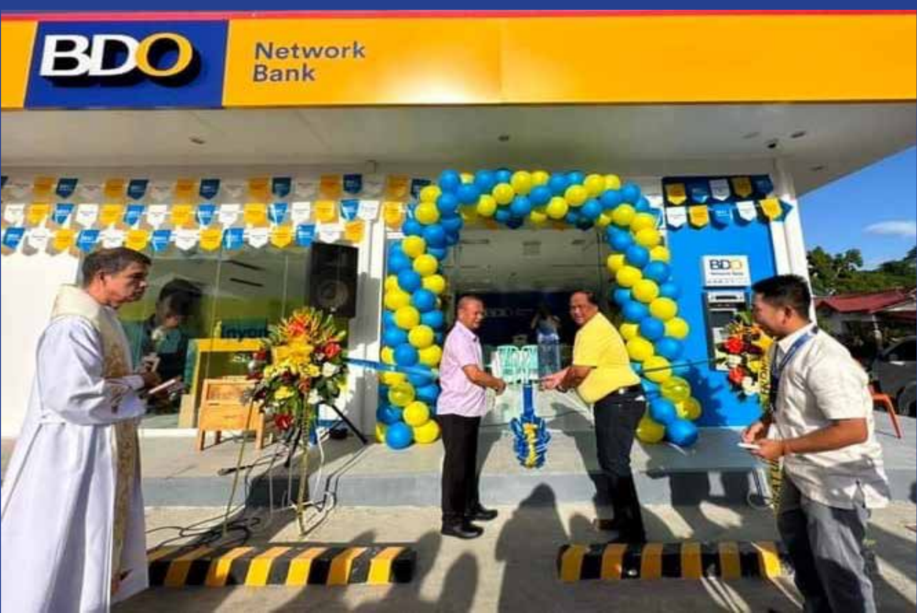
Open na ang BDO Network Bank Brooke's Point, Palawan para magserbisyo sa mga indibidwal at micro, small and medium enterprises (MSMEs) na nangangailangan ng financial solutions.