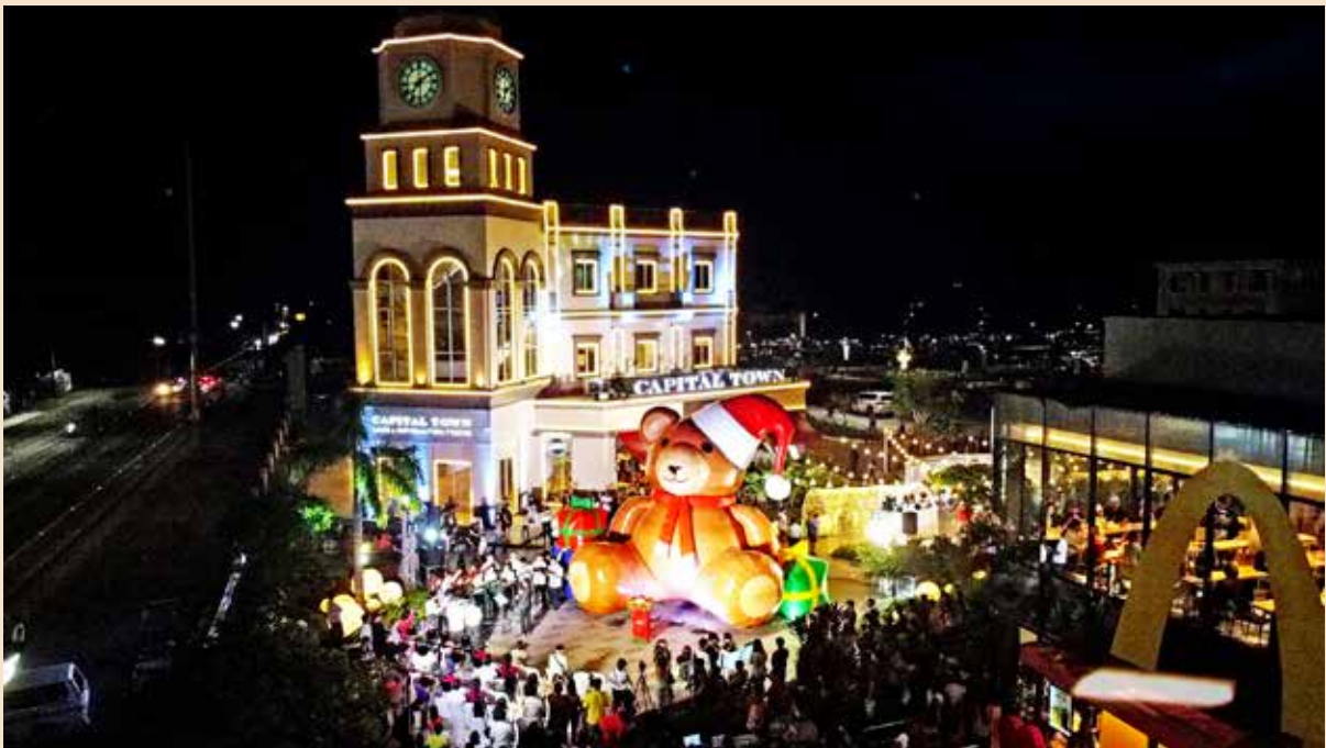
GIANT CHRISTMAS TEDDY BEAR IN PAMPANGA'S 'CHRISTMAS CAPITAL TOWN.' A 20-foot tall giant Christmas Teddy Bear delights Kapampangans and tourists visiting Capital Town Pampanga in the City of San Fernando. The massive installation, which sits just outside the Philippines' biggest McDonald's store and the iconic Capital Town Clock Tower and Showroom, has been unveiled together with other holiday surprises as the township lights up for the holidays. Capital Town Pampanga is located along Capitol Boulevard, just a minute away from the Pampanga Provincial Capitol.