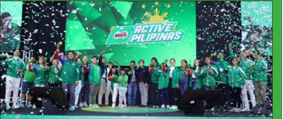
The MILO team, sports partners, and athletes capping off the launch of MILO Active Pilipinas.

MANILA, Philippines - February 1, 2023 — For 59 years, leading breakfast drink kids love MILO® Philippines has been nourishing Filipino kids with energy-giving nutrients and the well-loved chocolate taste that help them live an active lifestyle. Because with a sports-driven active lifestyle, kids not only reap physical benefits but take lifelong learnings and skills too. They take home new values such as perseverance, discipline, and grit which sets them up for success in all aspects of life.