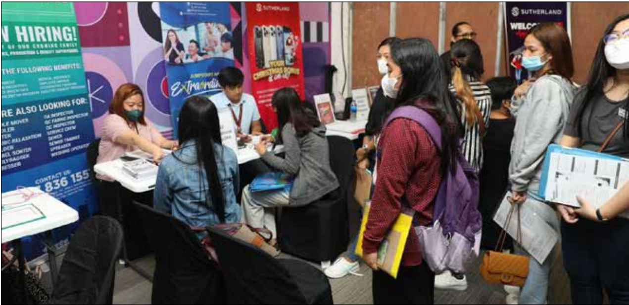
Job applicants from various communities near Clark flock to the CDC Job Fair 2022 held at the Clark Cityfront Mall.