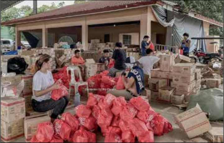
Pamaskong food packs sa mga Zambaleño.