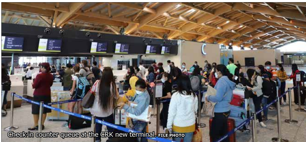
Check-in counter queue at the CRK new terminal. FILE PHOTO