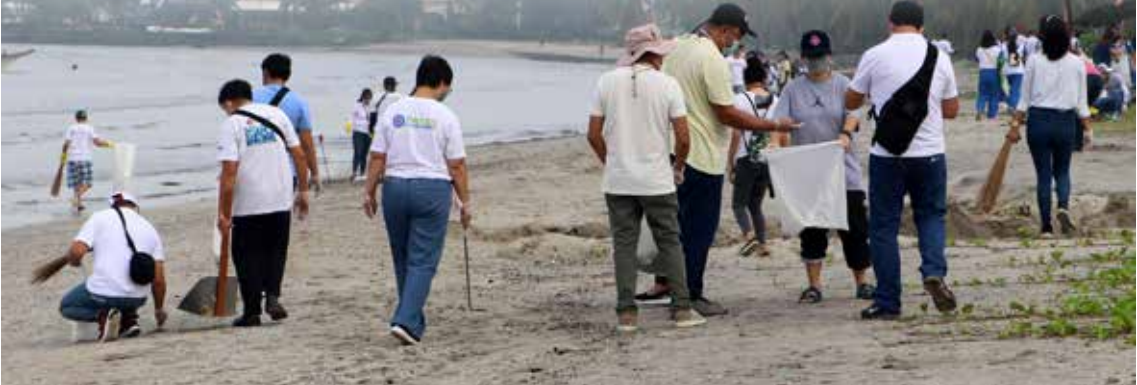
Employees, students and residents take part in a coastal clean-up drive along the Waterfront area of Subic Bay Freeport on Friday, September 16.