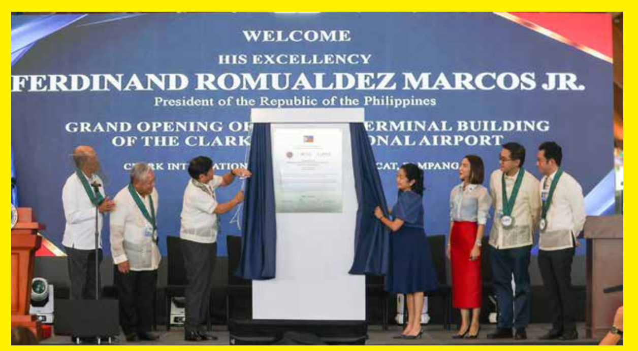
President Ferdinand R. Marcos Jr. and First Lady Liza Araneta-Marcos unveil the commemorative marker of the CRK New Terminal Building with other government and airport dignitaries.