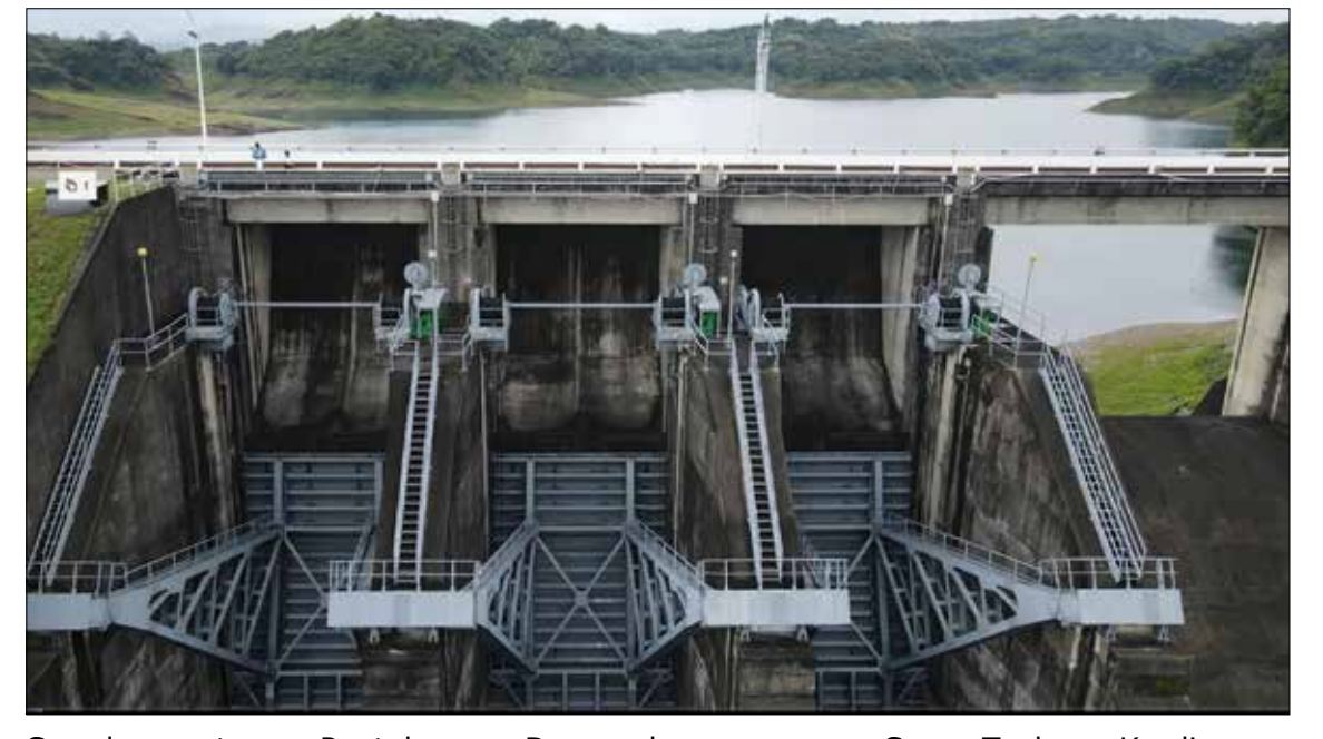
Saradong gates ng Pantabangan Dam sa kasagsagan ng Super Typhoon Karding.

Binigyang-diin niya na dahil panahon na ng anihan at umuulan ay hindi na talaga kailangan ng bukirin ang irigasyon kaya pagkakataon nila ito upang paghandaan ang tag-