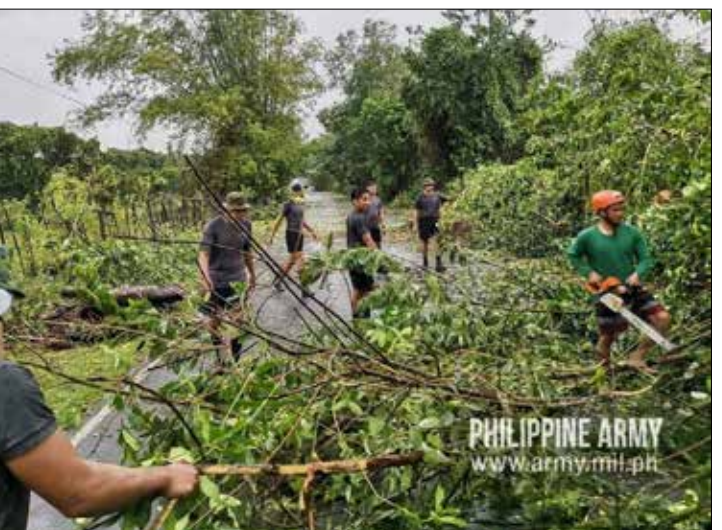
Army evacuation operations.

In times of need, the Philippine Army will maximize it its active and reserve force and will utilize its modern competencies, equipment and facilities to support humanitarian assistance and disaster response efforts, DPAO said.