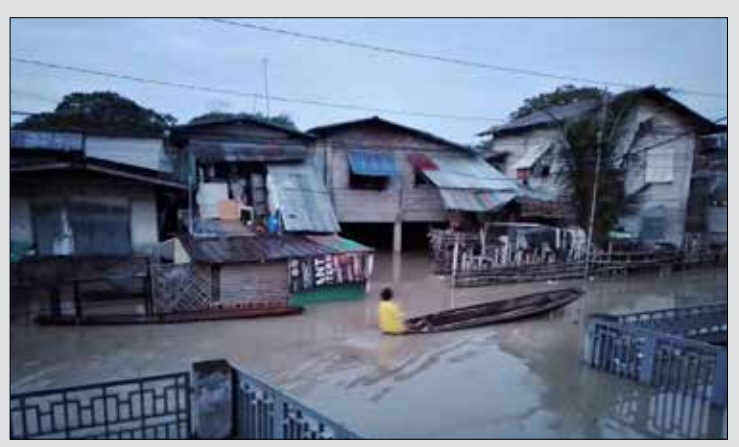
CANDABA WATERWORLD SEPTEMBER 27

Two days after the exit of Typhoon Karding, barangays in Candaba, Pampanga have remained under floodwater - waist-deep in many areas - making bancas as primary mode of transport.