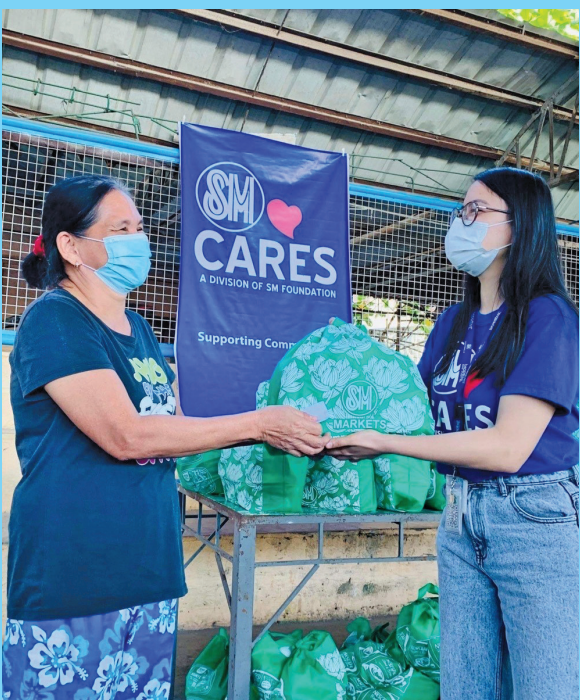
A resident of Brgy. Binauganan smiles in the eyes while being handed Christmas pack.

ASIDE FROM the Typhoon Odette relief distribution, SM Supermalls spread more than 30,000 packs all over the country to communities especially affected by the pandemic. This include, but not limited to, the displaced vendors or workers, persons with disabilities, senior groups, farmers, fishermen, and urban poor. For SM City Tarlac, there are 300 chosen beneficiaries from Brgy. San Roque, Brgy. Matatalaib and Brgy. Binauganan who receive family packs which include grocery items from SM Supermarket through the effort and program of SM Cares, SM Foundation, SM Markets, and mall management.