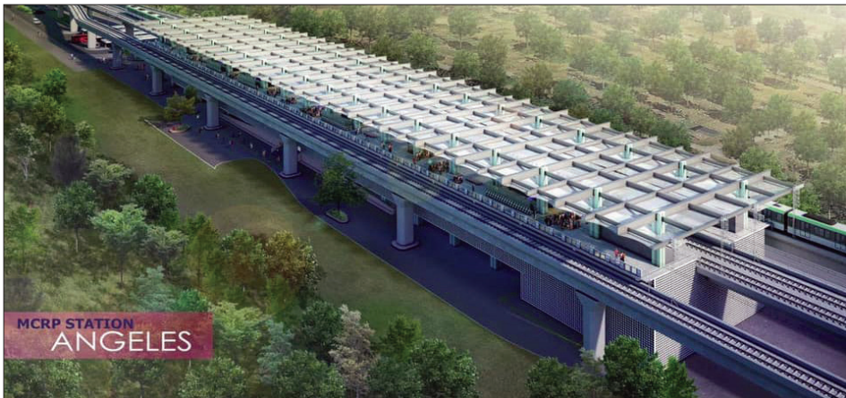
MCRP STATION ANGELES