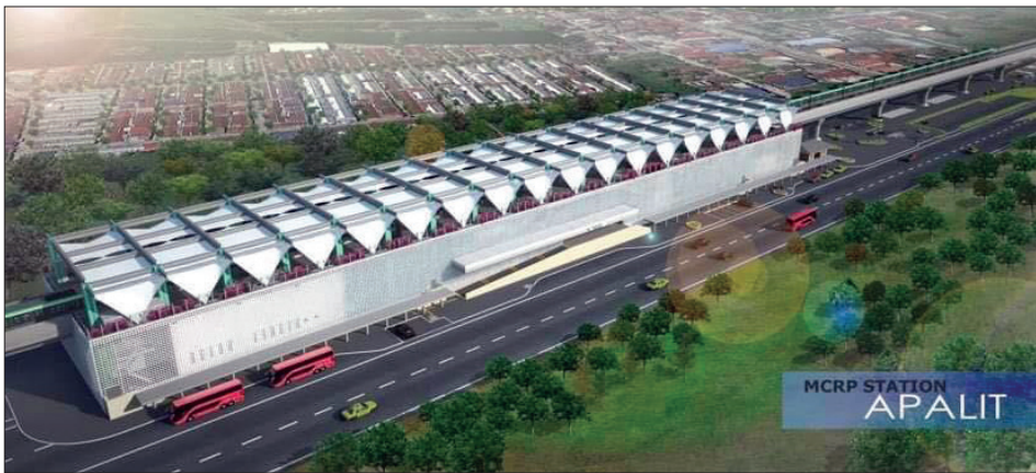
MCRP STATION APALIT