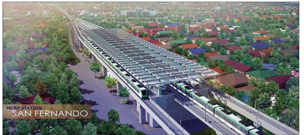
MCRP STATION SAN FERNANDO