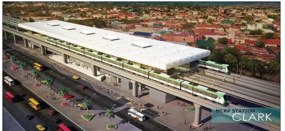
MCRP STATION CLARK