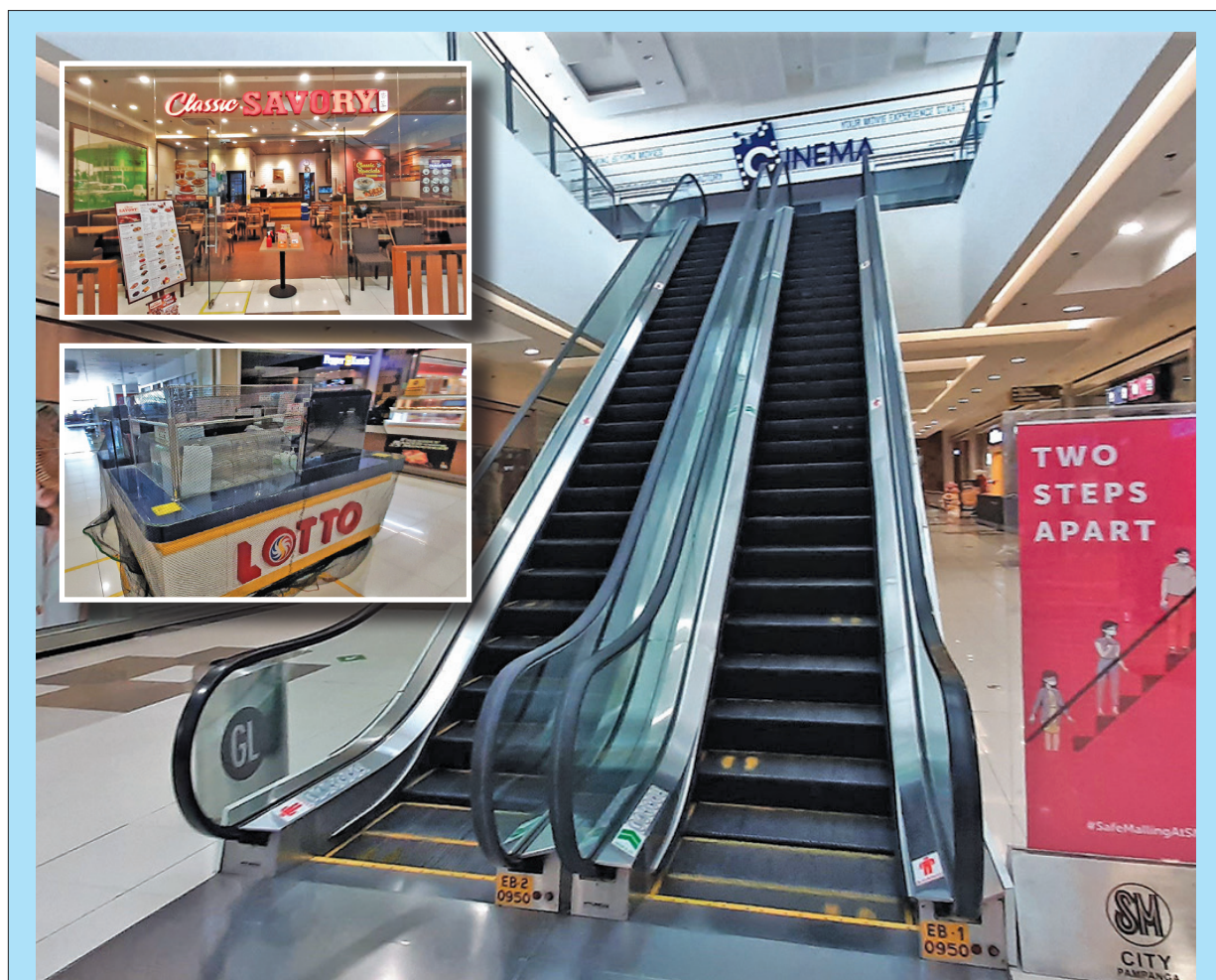
The pictures, taken 3 p.m. Tuesday tell the whole sad story.