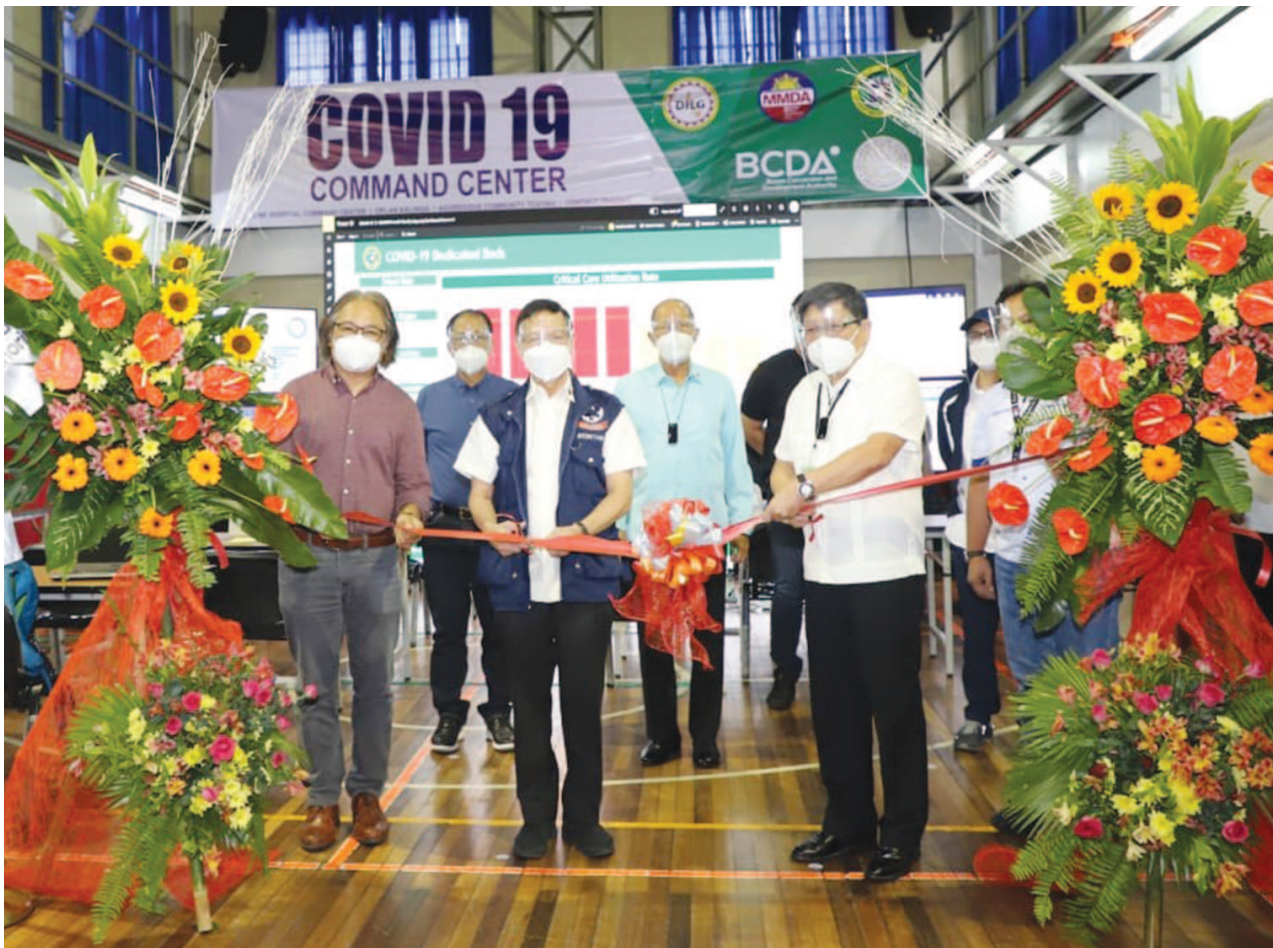
Ribbon-cutting of the One Hospital Command Center at the MMDA.