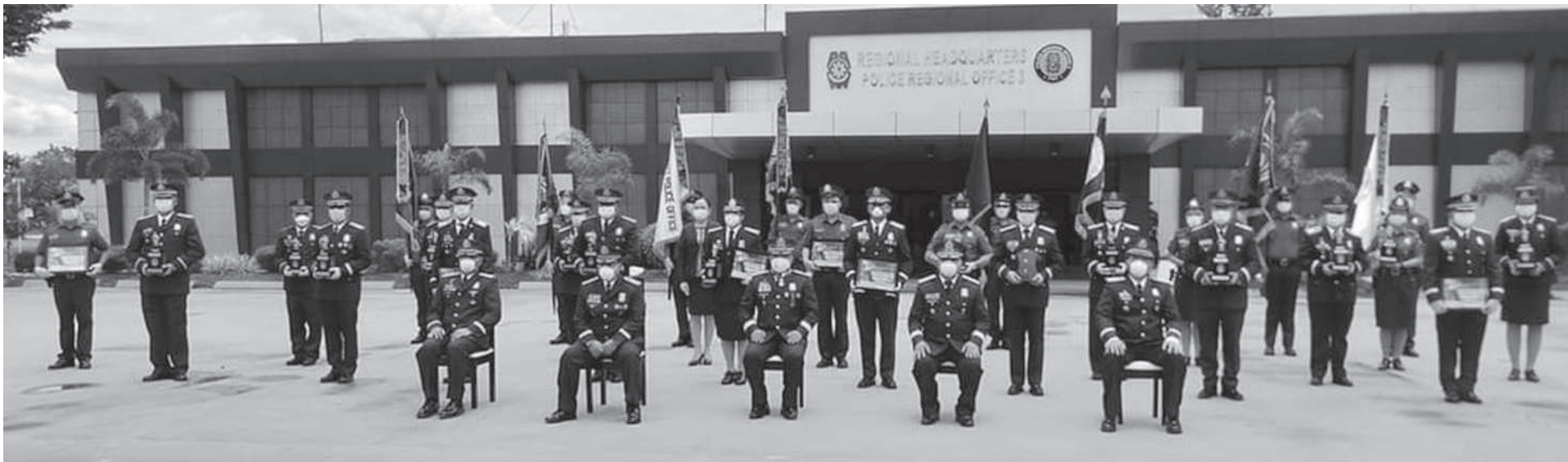
Hail to Central Luzon’s finest.