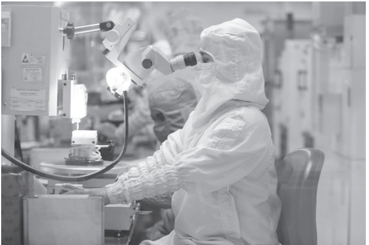
MORE JOB OPPORTUNITIES. Various developments in Clark Freeport Zone have paved the way for the creation of more job opportunities and sources of livelihood for residents and workers from the adjacent communities of the Freeport.

by the Mabalacat City Information Office, he likewise expressed his gratitude to the Clark Development Corporation (CDC) and its locators for their support on the City's COVID-19 efforts