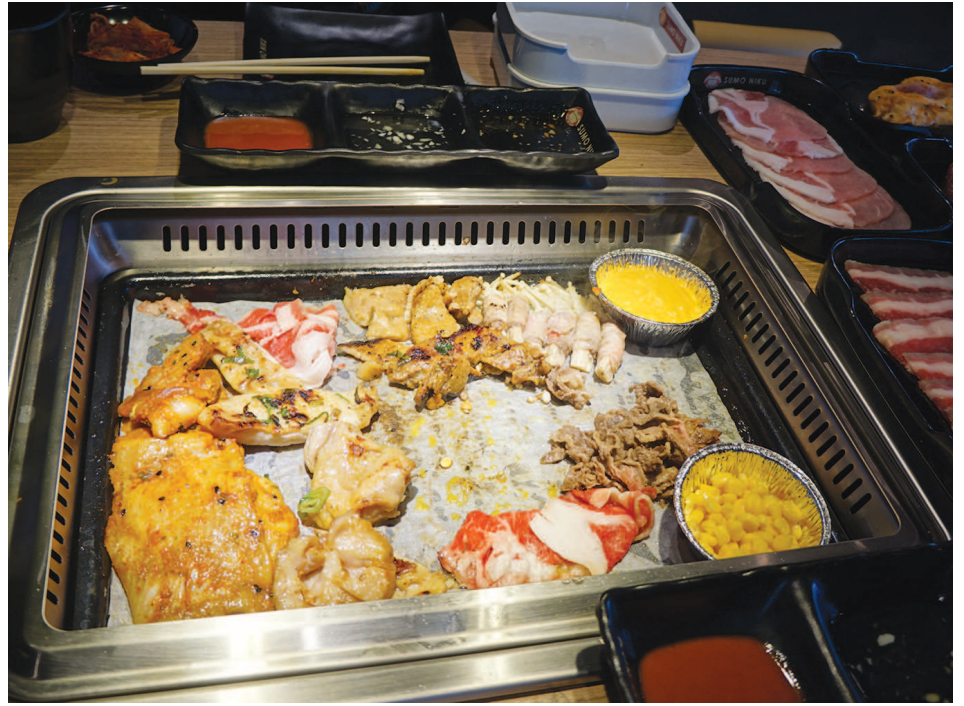
Delectable dishes.

worldbex.com | inquire@worldbexevents.com | +632 8656 9239