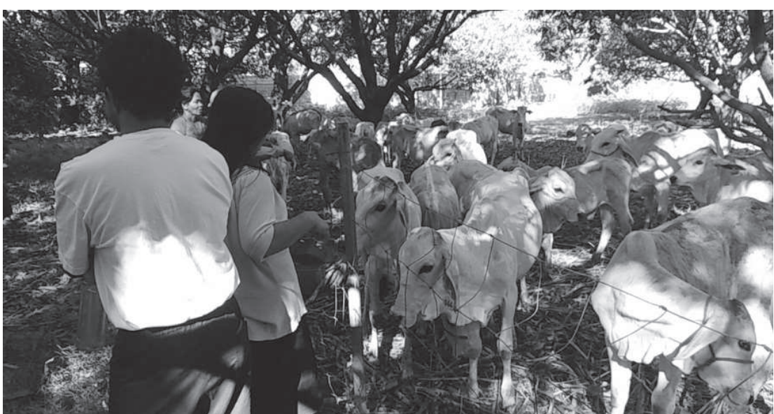
Pinagmamasdan ng mga benepisyaryo ang mga baka na ipinamamahagi sa kanila sa ilalim ng sustainable livelihood program ng DSWD at LGU Zambales.