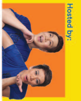
MC & Lassy