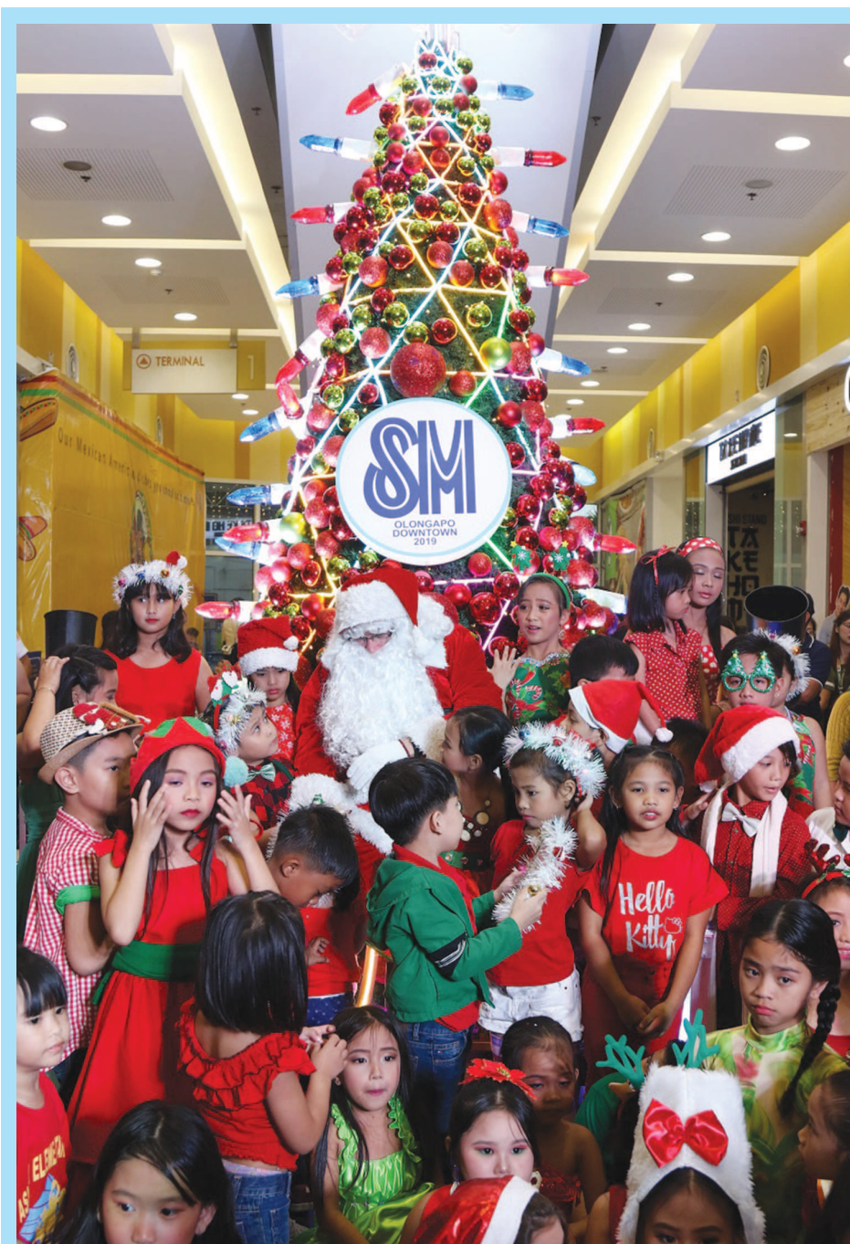
SANTA'S COME TO TOWN. At SM City Olongapo Downtown bringing his bag of goodies for kids of the city.