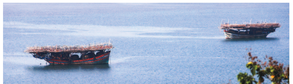
Two of the three Vietnamese fishing vessels that remain on Subic Bay in this photo taken on Tuesday.

Officers from the SBMA Law Enforcement Department's Harbor Patrol