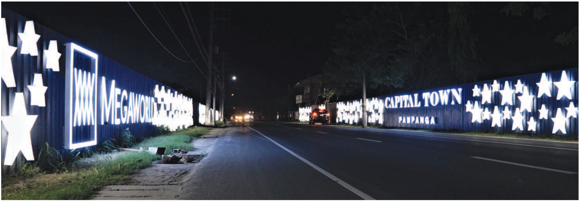
AVENUE OF STARS. A stretch of the Capitol Avenue where Megaworld's Capital Town project in the City of San Fernando is lighted up with white lanterns adding up to the joyful Yule atmosphere in the renowned Christmas Capital of the Philippines.