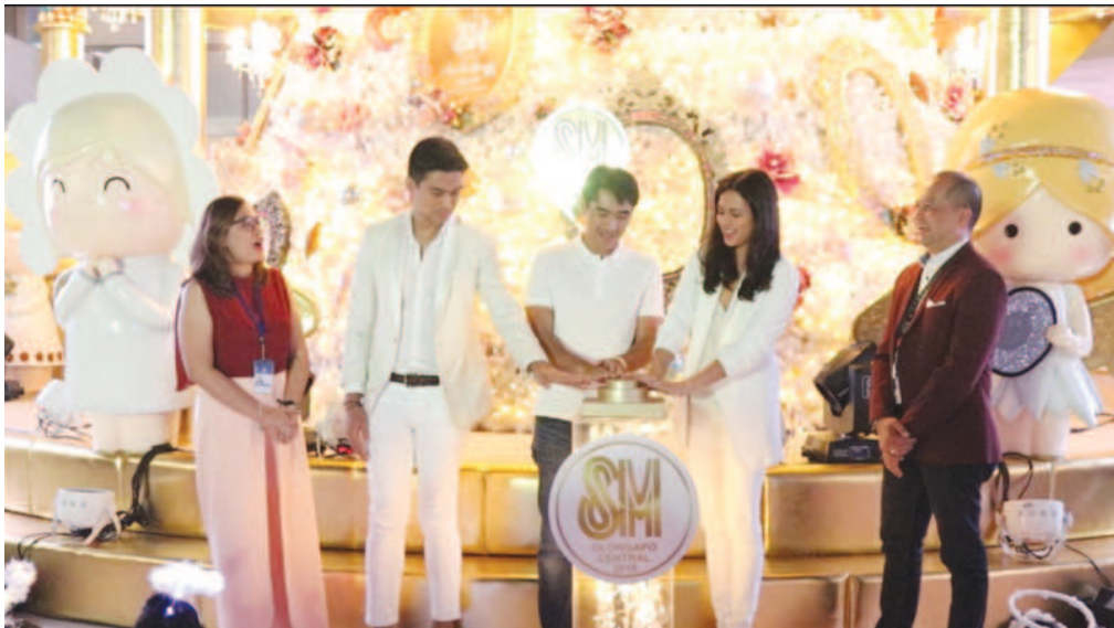
SM City Olongapo Central with a City of Angels theme has a 30-ft grand Christmas Tree accented with white and gold colors.