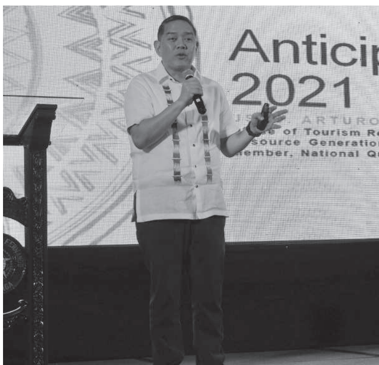
Tourism Undersecretary Arturo Boncato Jr. announces landmarks taking part in the 500-day countdown to the quincentennial celebration.

"The 21 sites represent various periods in our history