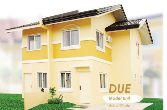
DUE Model Unit Actual Photo