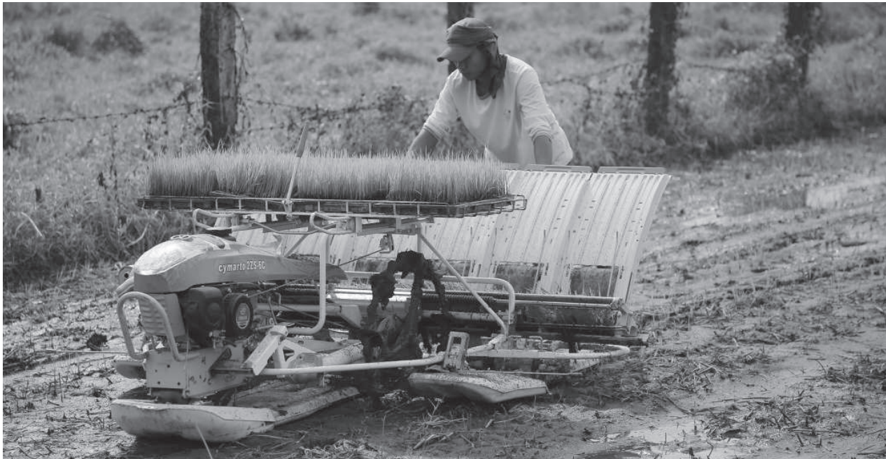
INTENSIFYING FARMING. The use of a mechanical rice transplanter is demonstrated for the farmers of the City of San Fernando, as part of the Farmers' Week celebration of the city government on May 10 at Brgy. Del Carmen. CONTRIBUTED PHOTO

leged vote buying included a 71-year-old farmer who received a P100 bill in exchange for a local candidate's vote in Tarlac City, as well as seven others who reportedly tried to distribute money in exchange for votes for a local candidate in Sto. Tomas, Pampanga.