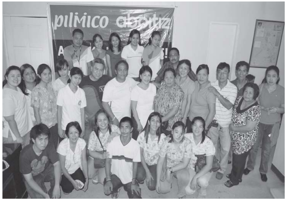
Pilmico ComRel Team together with Capas Rural Health Unit volunteers.

Pilmico Animal Nutrition Corporation, a subsidiary of Aboitiz Equity Ventures, is manufacturing high quality animal nutrition products. It has a commercial feeds manufacturing plant in Sto. Domingo II, Capas, Tarlac and in Iligan City. It also has a swine breeding and finishing operations in barangays Aranguren and Cut-Cut also in Capas, Tarlac.