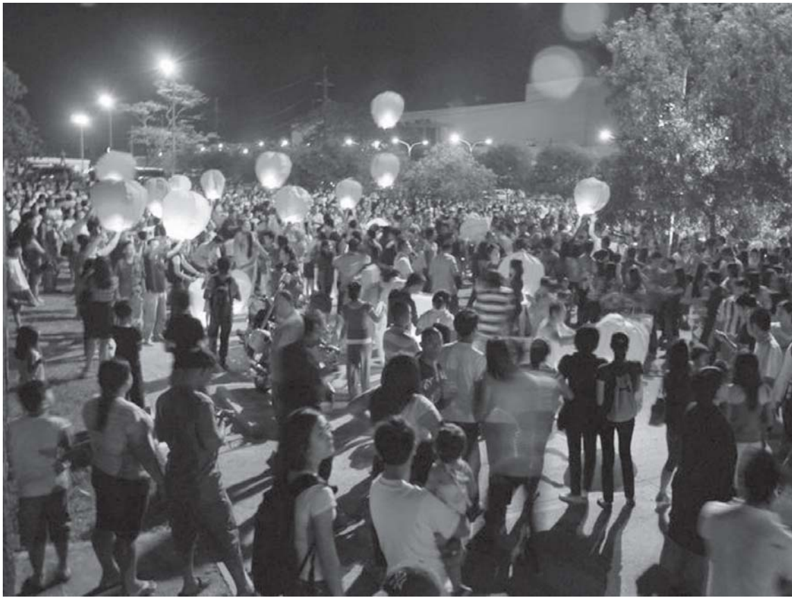
Mallgoers witness the Heliumistic Fashion Show that displays unique and magnificence of balloon-inspired creations on February 14 at the SM City Clark.

WHAT CAN one expect when love and fortune collide? Everyone's all love and fortune last February 14, 2010, when we celebrated Valentine's Day and Chinese New Year in one red-letter day.