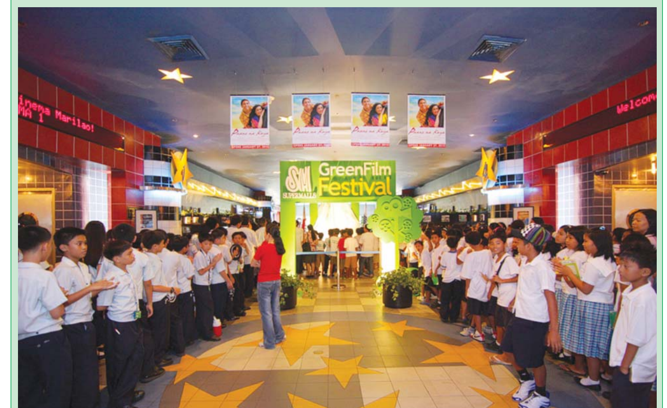
Students from various public and private schools in Marilao lineup to learn about climate change at SM's Green Film Festival.